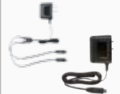
1 x Y Cable and 1 x Single Cable Adaptor