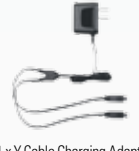
1 x Y Cable Charging Adaptor with Dual Micro-USB Connectors