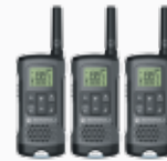
3 x T200 Radios