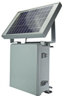
Solar Power Kit