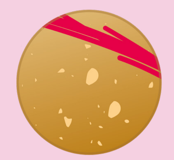
PB & J Cookie