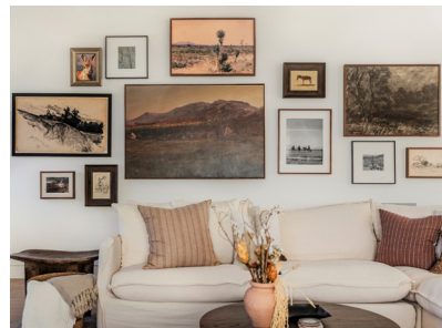
Great Collectors of Contemporary Realism

Reach 67,000 Highly Affluent, Hard-to-Reach, Art-Buying Collectors in This High-Distribution Issue.