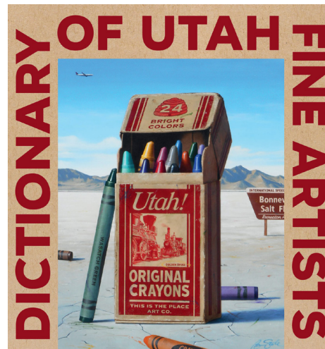
The Dictionary of Utah Fine Artists