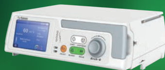
Erch - 6