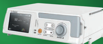
Anim - 8