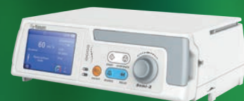
Semi - 2