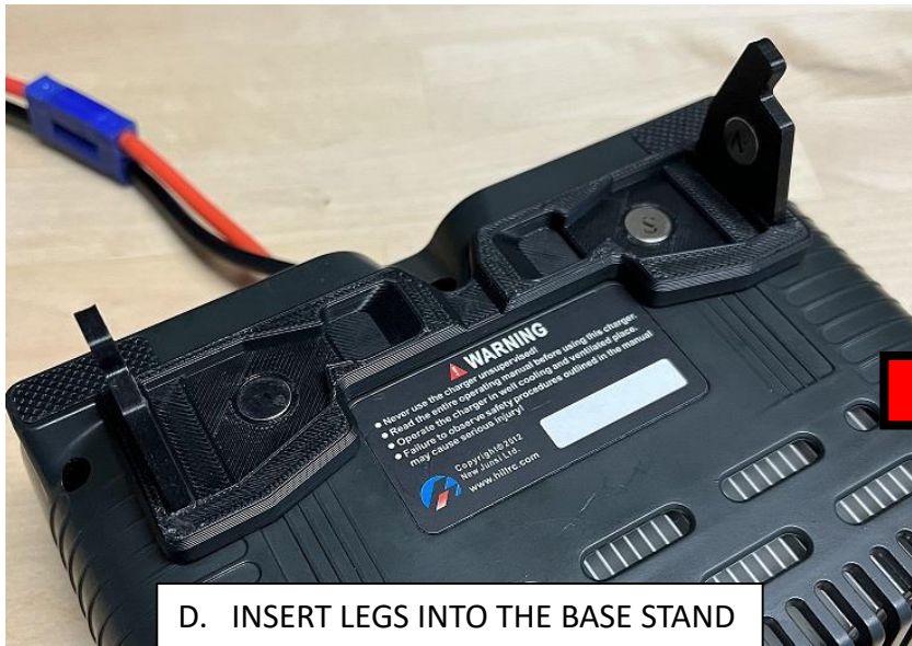
D. INSERT LEGS INTO THE BASE STAND