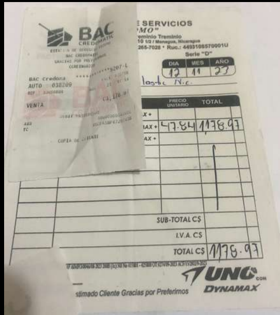
Ingredients & Plastic Transportation 87.86 USD