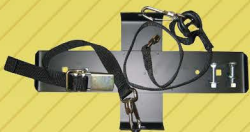
Carry Rack For Truck Mounting