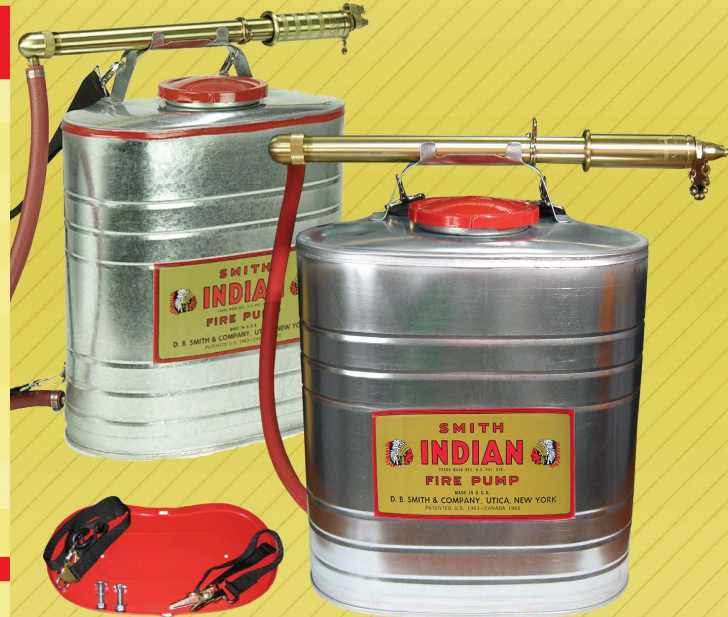
Steel Tank Carry Rack

Same features as above, but made of stainless steel for added longevity, 5 gallon.