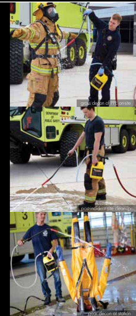
gross decon of PPE on-site