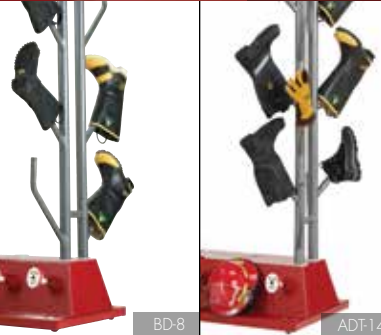
Special-Ops Gear Dryer

Four Drying Units; 12 Accessory Ports; Invertible Stickmen