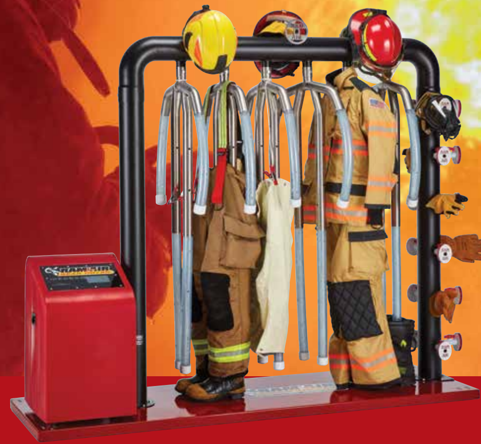
6-Unit Turnout Gear Dryer with Touchscreen Control

Model TG-8 – Ambient Air Only (shown); Model TG-8H – Ambient & Heated Air