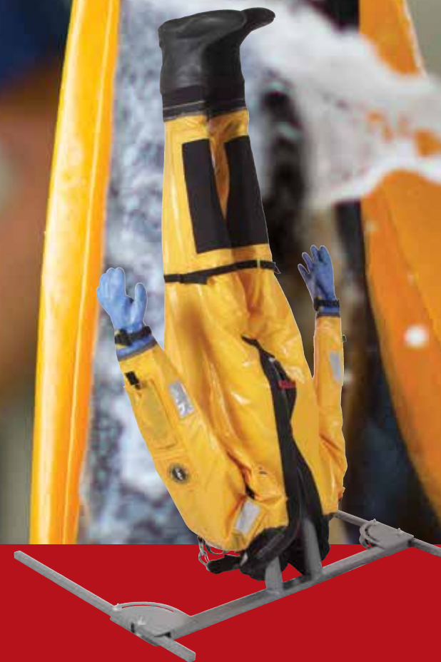
Rinse Station/Staging Accessory Model RS-BSTK (with stickman) Model RS-B (without stickman)