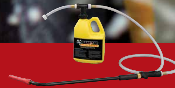
PPE Decontamination Sprayer Model Decon-1