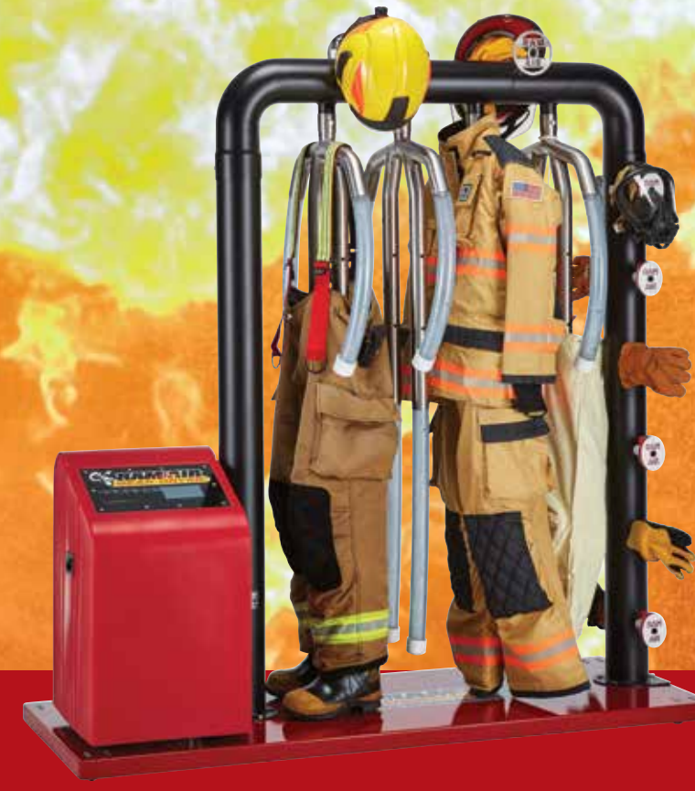
4-Unit Turnout Gear Dryer with Touchscreen Control

Model TG-6 – Ambient Air Only (shown); Model TG-6H – Ambient & Heated Air