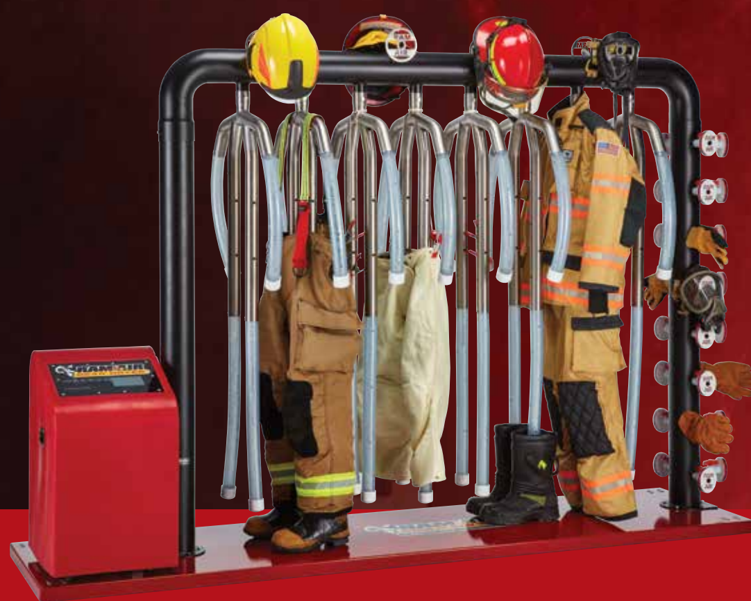
8-Unit Turnout Gear Dryer with Touchscreen Control

Eight Drying Units; 8 Helmet Dryers; 24 Accessory Ports