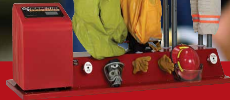
Special-Ops Gear Dryer Four Drying Units; 12 Accessory Ports; Invertible Stickmen Model T4-IHT