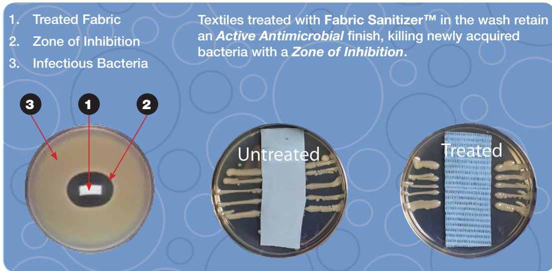
Figure 2 Transfer of the antimicrobial by skin contact has already been shown to be undetectable in the case of the most thoroughly-studied antimicrobial in the market.