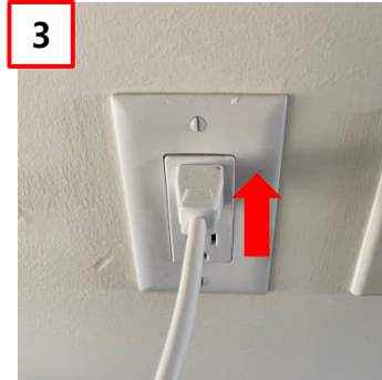
③ After hearing the water sound and plug it back