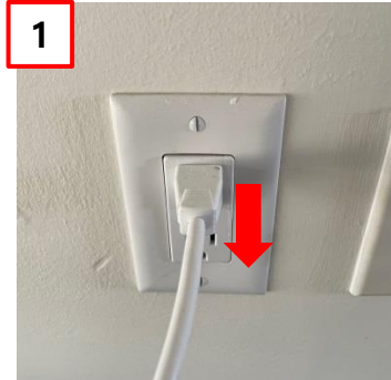
① Unplug the cord