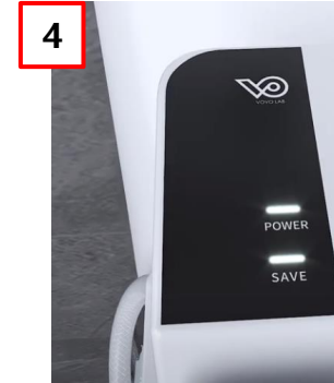
④ Please make sure the LED is solid.