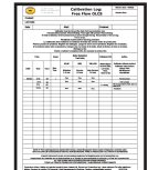
Optical Laser Color Sorter (OLCS) Calibration Log