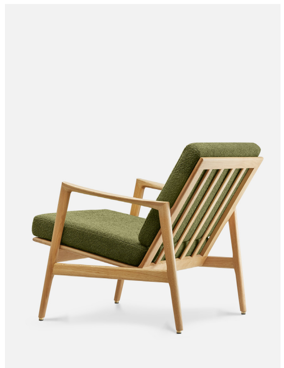
Boucle Coll. - Olive / Oak 02