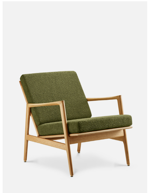
Boucle Coll. - Olive / Oak 02

100% designed and manufactured in Poland