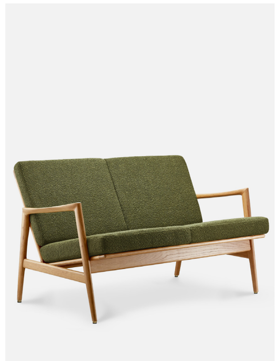
Boucle Coll. - Olive / Oak 03

100% designed and manufactured in Poland