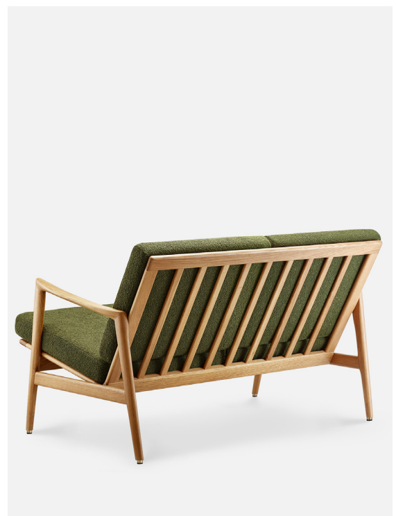
Boucle Coll. - Olive / Oak 03