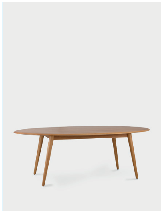
Table Ellipse / Oak 03