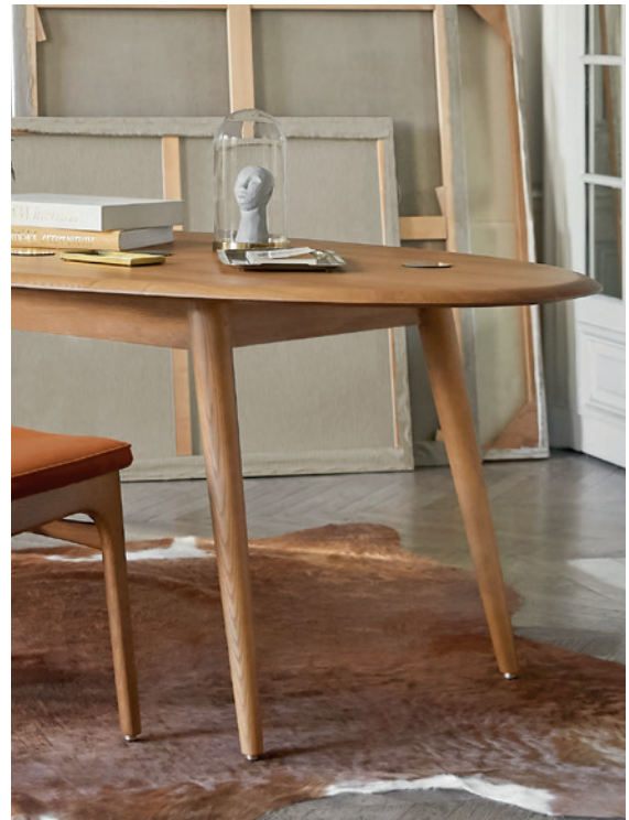
Table Ellipse / Oak 03

100% designed and manufactured in Poland