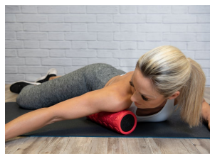
Shoulder/Deltoid TIME: 30-90 seconds VIBRATION LEVEL: 3-4