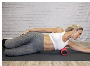
Lats TIME: 30-90 seconds VIBRATION LEVEL: 2-3