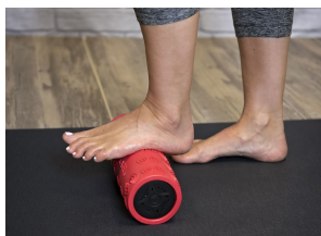
Feet TIME: 30-90 seconds VIBRATION LEVEL: 1-2