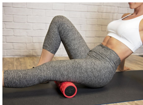
Hamstrings TIME: 30-90 seconds VIBRATION LEVEL: 1-2