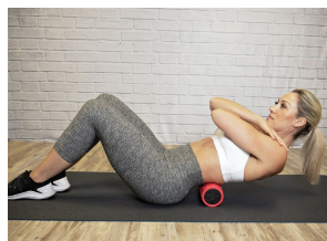
Lower back / QL TIME: 30-90 seconds VIBRATION LEVEL: 2-3