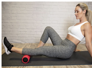
Calves TIME: 30-90 seconds VIBRATION LEVEL: 1-2

Congratulations on the purchase of your Power Plate® Roller.™ Follow this quick start guide to help you rejuvenate tight and sore muscles, relieve tension and feel better overall.