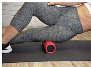
Lateral Quad/ITB TIME: 30-90 seconds VIBRATION LEVEL: 3-4