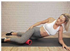
Medial Hip/Adductors TIME: 30-90 seconds VIBRATION LEVEL: 2-3