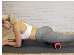
Anterior Hip/Quads TIME: 30-90 seconds VIBRATION LEVEL: 2-3