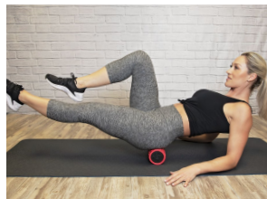
Lateral Hip/Glutes TIME: 30-90 seconds VIBRATION LEVEL: 1-2