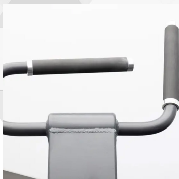
Durable Urethane Multi-Grip Handles