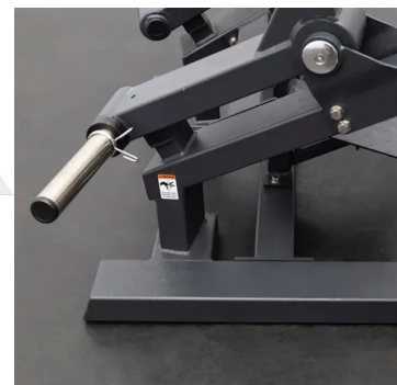
Nickel-Plated Weight Plate Storage and Loading Bars