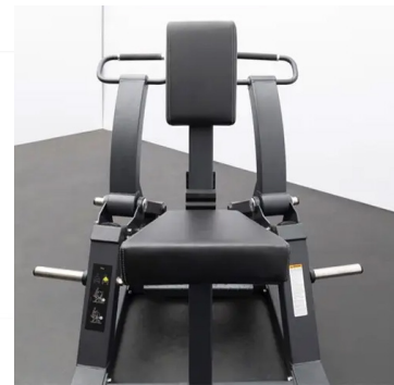
Independent Movement Arms and Proper Angles