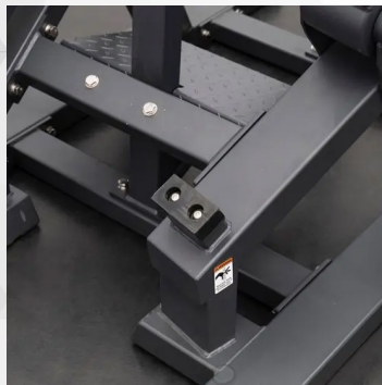
11-Gauge Steel Construction Frame