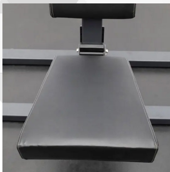
Adjustable, Padded Seat