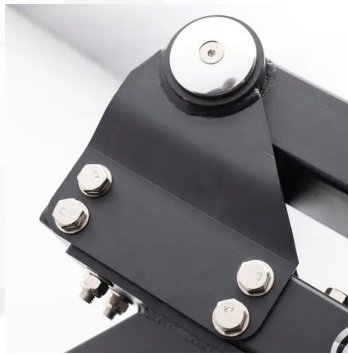
Commercial Rated Precision Pivot Bearings