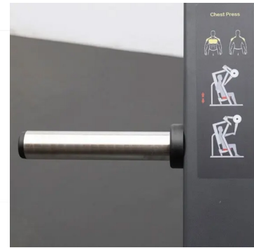
Nickel-Plated Weight Plate Storage and Loading Bars