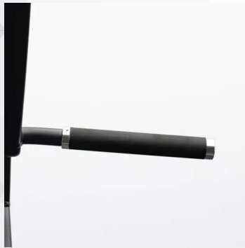
Heavy Duty Foam Grips For variety and added longevity