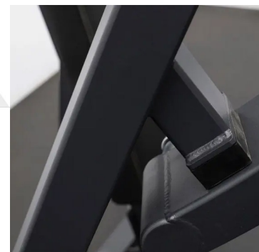
11-Gauge Steel Frame Construction With electrostatic powder coat finish