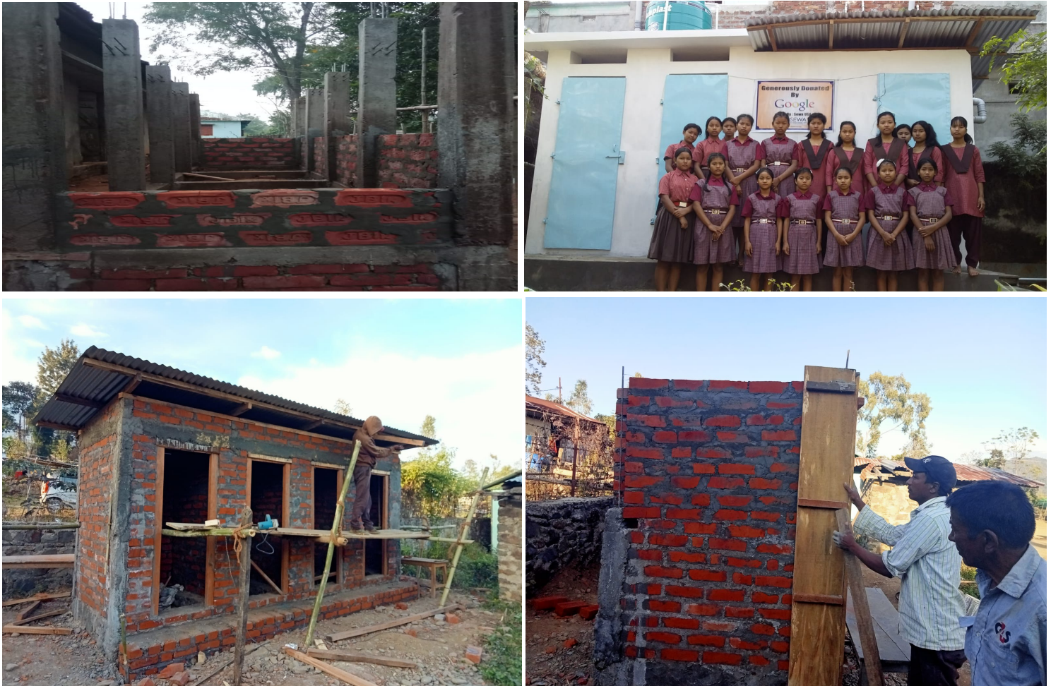
Figure : Toilets construction in northeastern states, India.

We have identified a govt school in Murgod which was built while British rule in India and later has been used as a prison and now it is serving around 700 children. We have taken the task of renovating few urinals and toilets and likely to start in January first week.