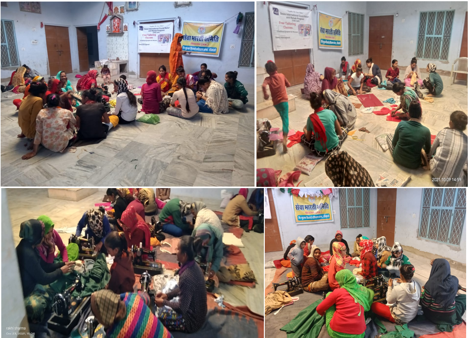
Figure : Free tailoring & embroidery program viratnagar,rajasthan.

We are also encouraging 8 of these women by giving them free sewing machines so that they can be self employed.