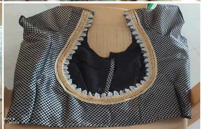
Figure: Tailoring centres in karnataka