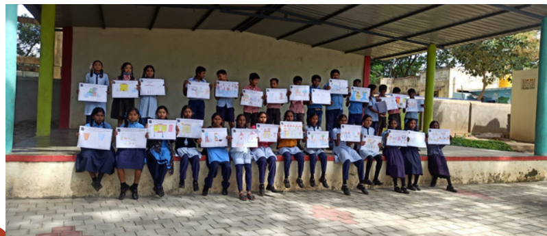
Magadi, Ramanagara, Hubli and Belgaum, Karnataka Painting competition aimed at raising awareness among students about the significance of WASH.