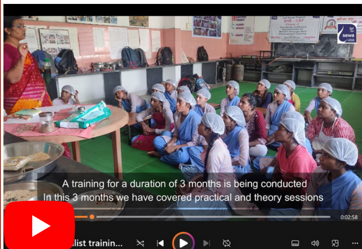
A training for a duration of 3 months is being conducted In this 3 months we have covered practical and theory sessions

This training program significantly enhanced the knowledge, understanding, and awareness of nutrition among the students. It equips them to pursue careers as diet counselors in hospitals, providing guidance to pregnant women, lactating mothers, adolescents, and malnourished individuals, especially malnourished children.