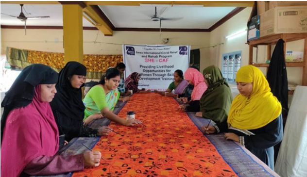
Srikalahasti, Andhra Pradesh