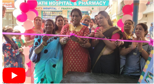
Sewa Pride - Empowering Trans Lives