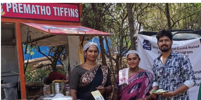
Transgender beneficiaries, Telangana