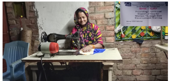
Phulia, West Bengal