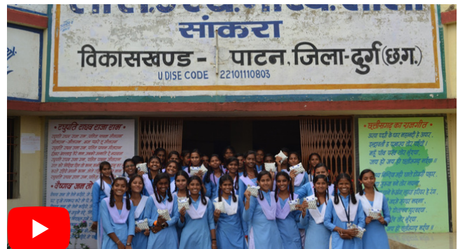
Sewa LEAD students empowering Girl students in India