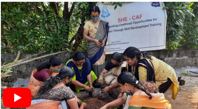
Transforming lives of women in Thrissur, Kerala