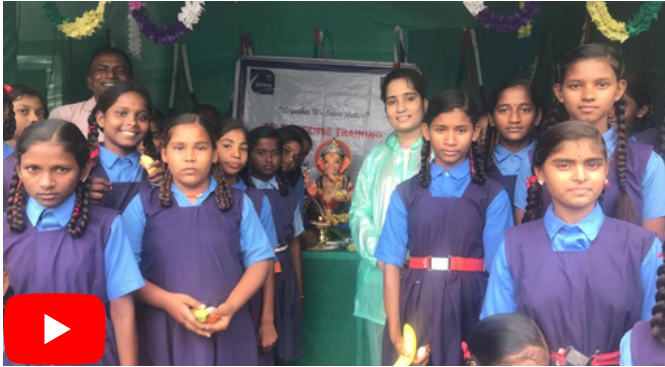
Model Village, Chattisgarh