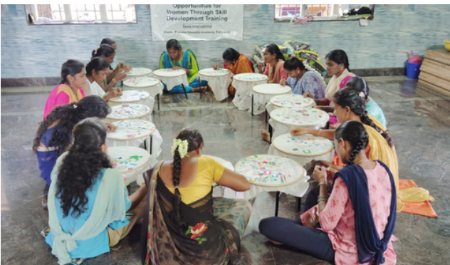
Dharmapuri, Tamil Nadu