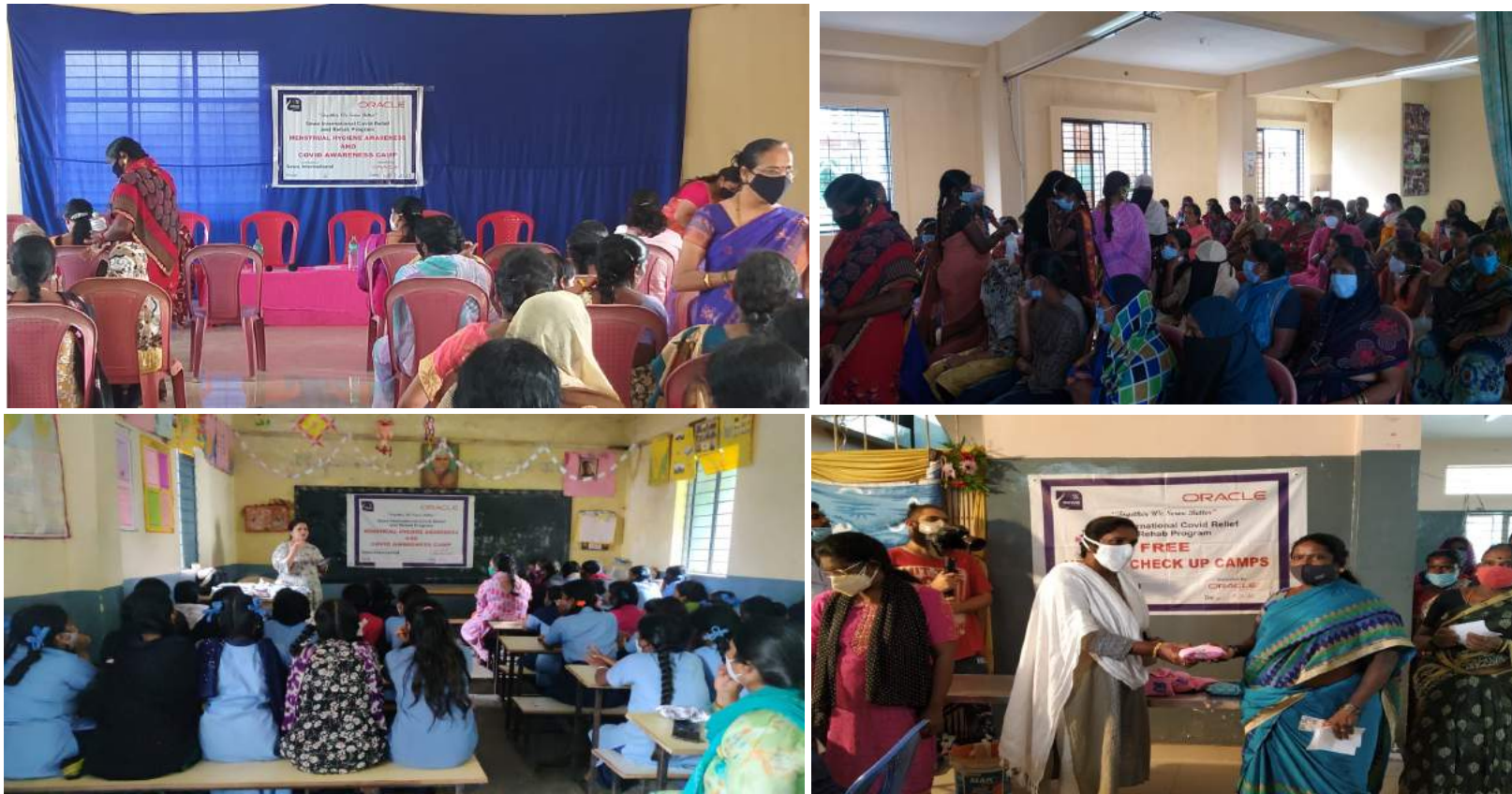
Figure: Free Menstrual awareness camps

We are promoting plastic free re-usable cloth sanitary napkins which are eco-friendly. Through this program we are educating rural & backward community women on menstrual hygiene.