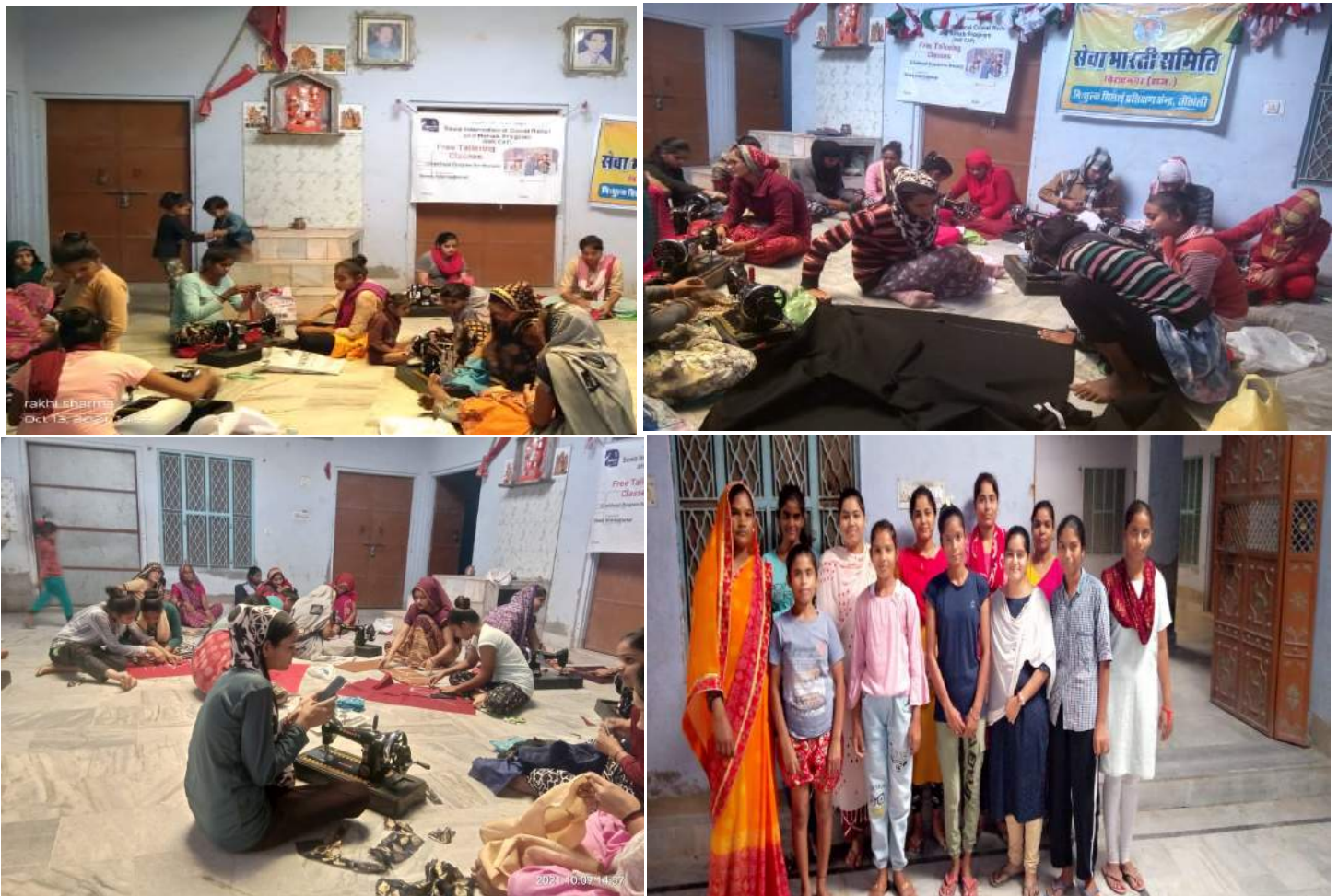
Figure : Free tailoring & embroidery program viratnagar,rajasthan.

We are also encouraging these women by giving them free sewing machines so that they can be self employed.