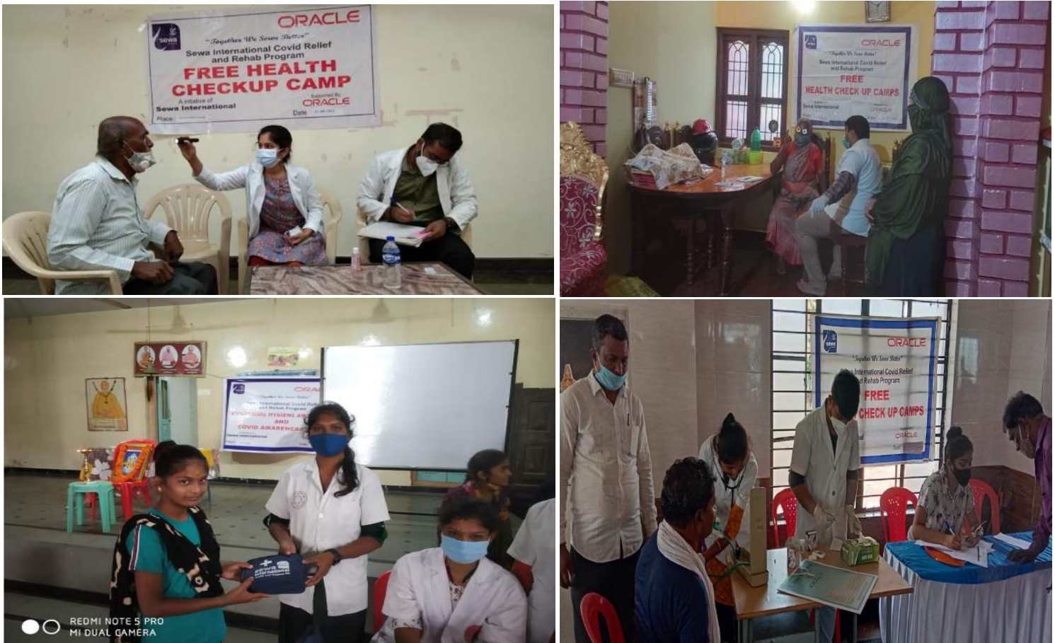
Figure: Free Health checkup camps

We do basic health check up, Blood pressure test, sugar test, eye and dental checks for the beneficiaries and also distribute free immunity boosters and multivitamins to them.