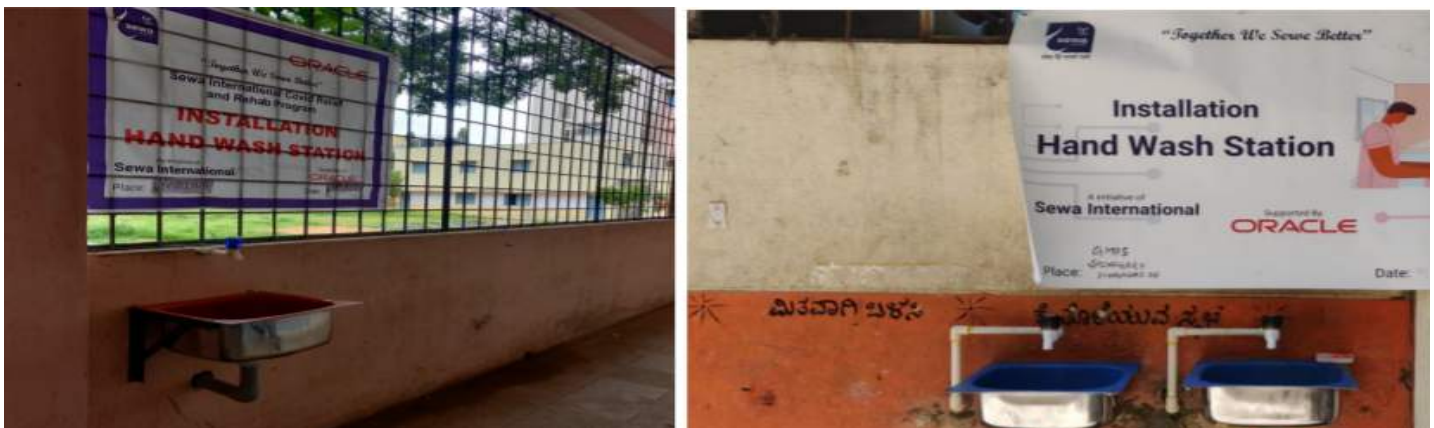
Figure : Free Hand wash station installation in Karnataka

We are installing hand wash units in the government schools,communities. This will help them to wash their hands frequently and stay safe from corona virus.