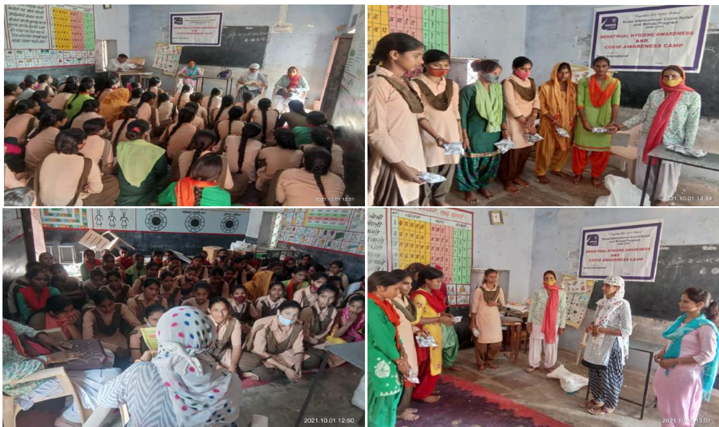
Figure : Menstrual hygiene camps conducted in viratnagar,rajasthan.

Water and snacks for all the beneficiaries.