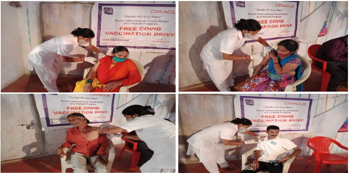
Figure : Free vaccination camps in Karnataka.

We have successfully completed the vaccination drive for 3000 targetted beneficiaries across karnataka state.