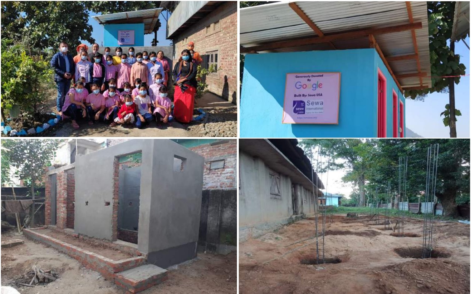
Figure : Toilets construction in northeastern states,india.

karnataka -Priliminary survey has been done in murgod region of northern karnataka and toilets will be installed in the govt school of murgod post due diligence done by our team.