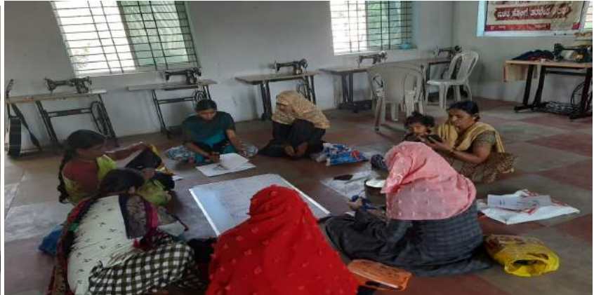
Figure: Tailoring centres in karnataka