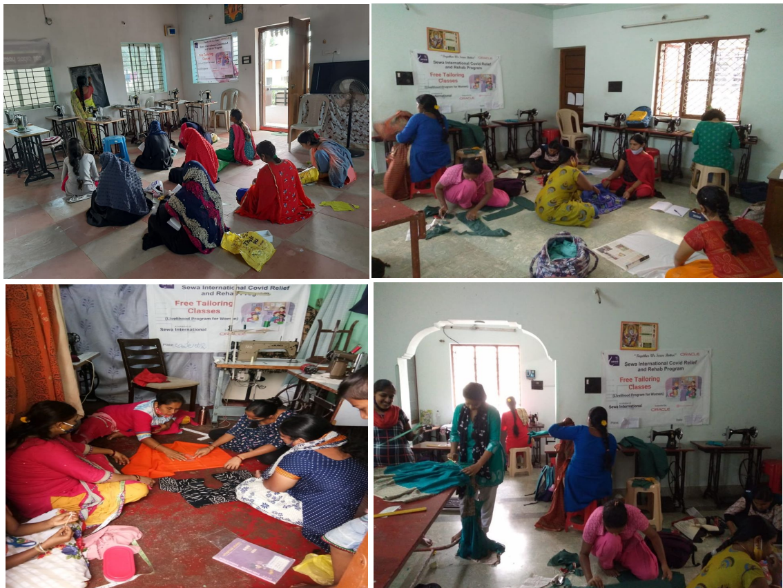
Figure: Tailoring centres in Karnataka

We are conducting free tailoring classes for ladies who are from economically backward community. Currently we are running four centres spread across karnataka. We have reached 100+ women across these three centres and they will be trained in basic and advanced tailoring.