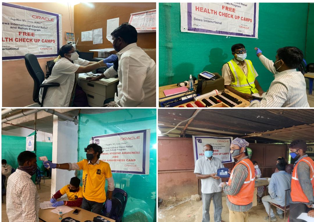
Figure: Free Health checkup camps