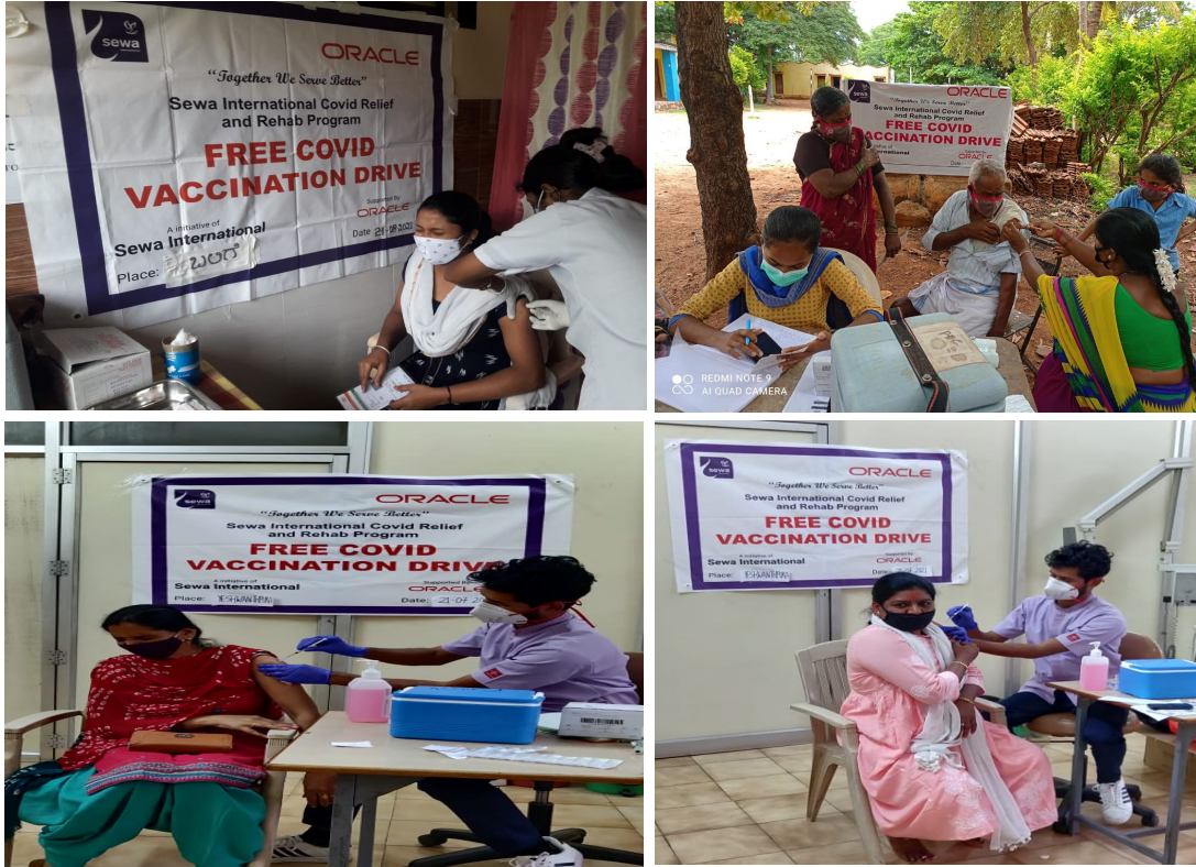
Figure : Free vaccination camps in Karnataka.

We are working with government and organising camps,mobilising people in rural areas.