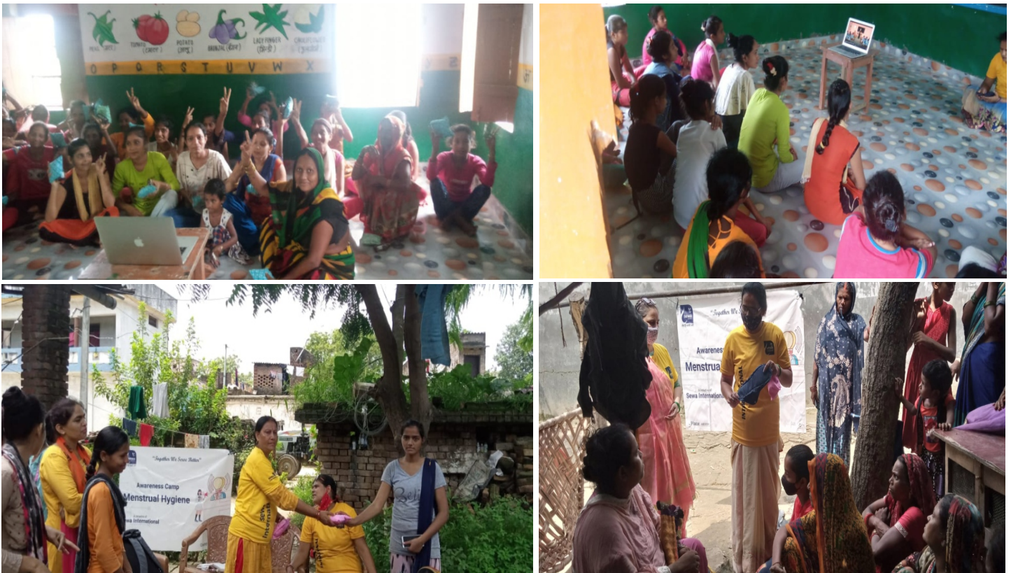
Figure : Menstrual hygiene camps conducted in Ayodhya.