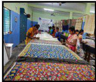
Pen & Block Kalamkari Painting