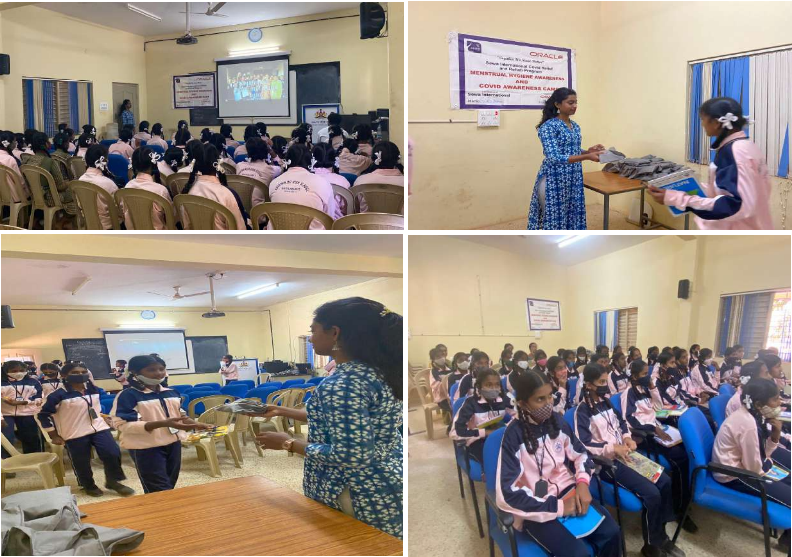
Figure: Free Menstrual awareness camps

We are promoting plastic free re-usable cloth sanitary napkins which are eco-friendly. Through this program we are educating rural & backward community women on menstrual hygiene.