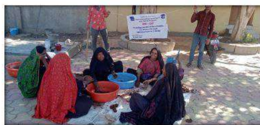
Micro enterprise- Making products from cow milk and cow dung