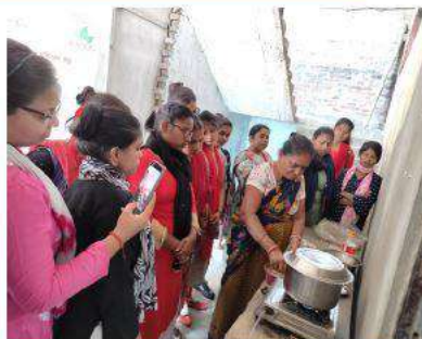
Microenterprise – papads & pickles