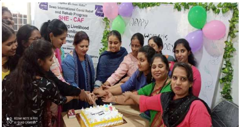
Figure: SHE-CAF project visits by sewa team