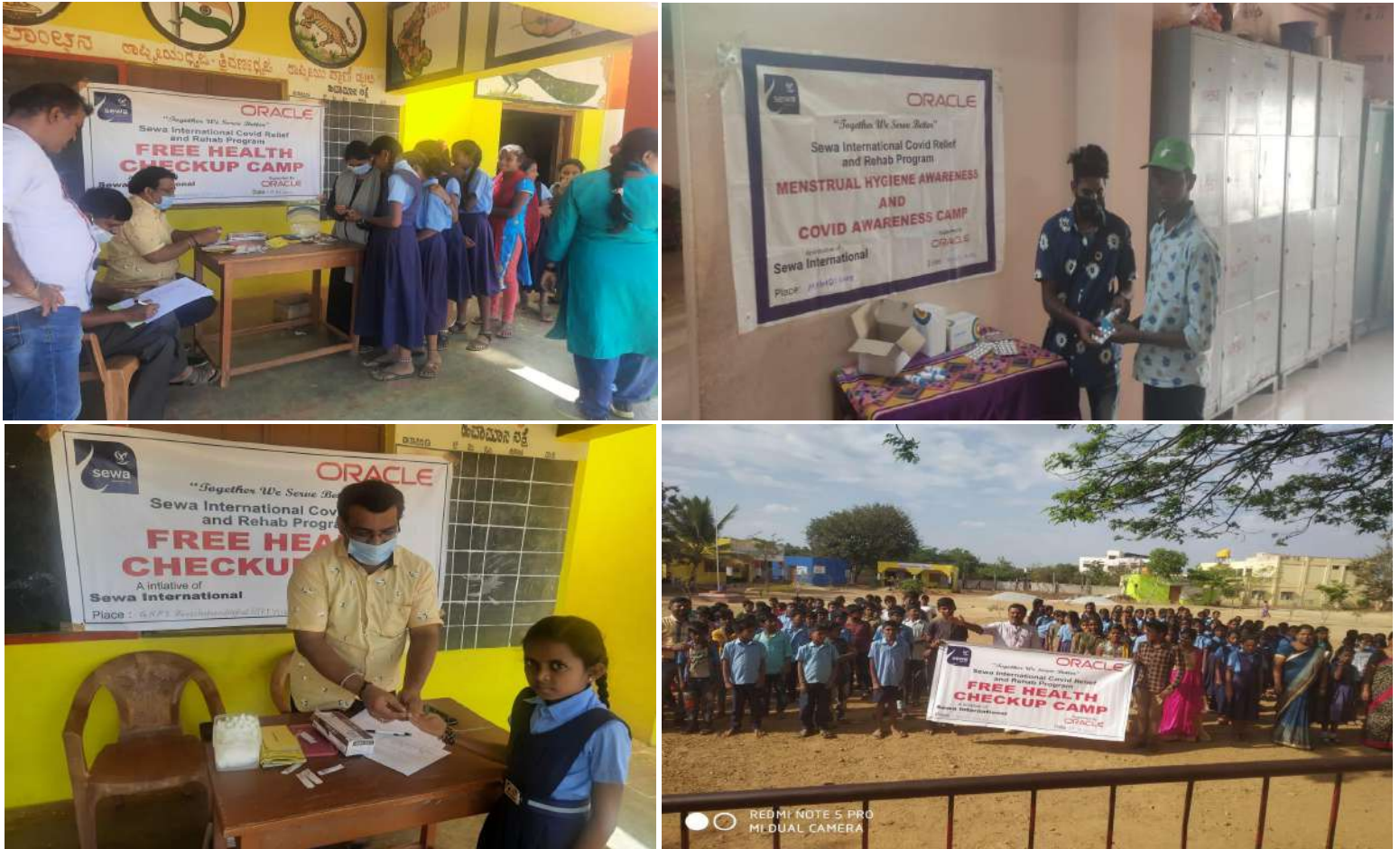
Figure: Free Health checkup camps

We do basic health check up, Blood pressure test, sugar test, eye and dental checks for the beneficiaries and also distribute free immunity boosters and multivitamins to them.