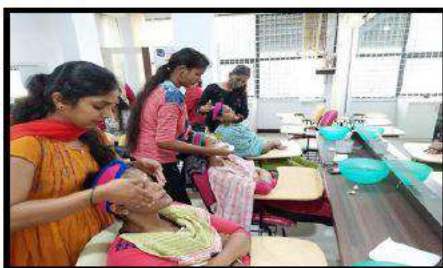
Beauty and Wellness