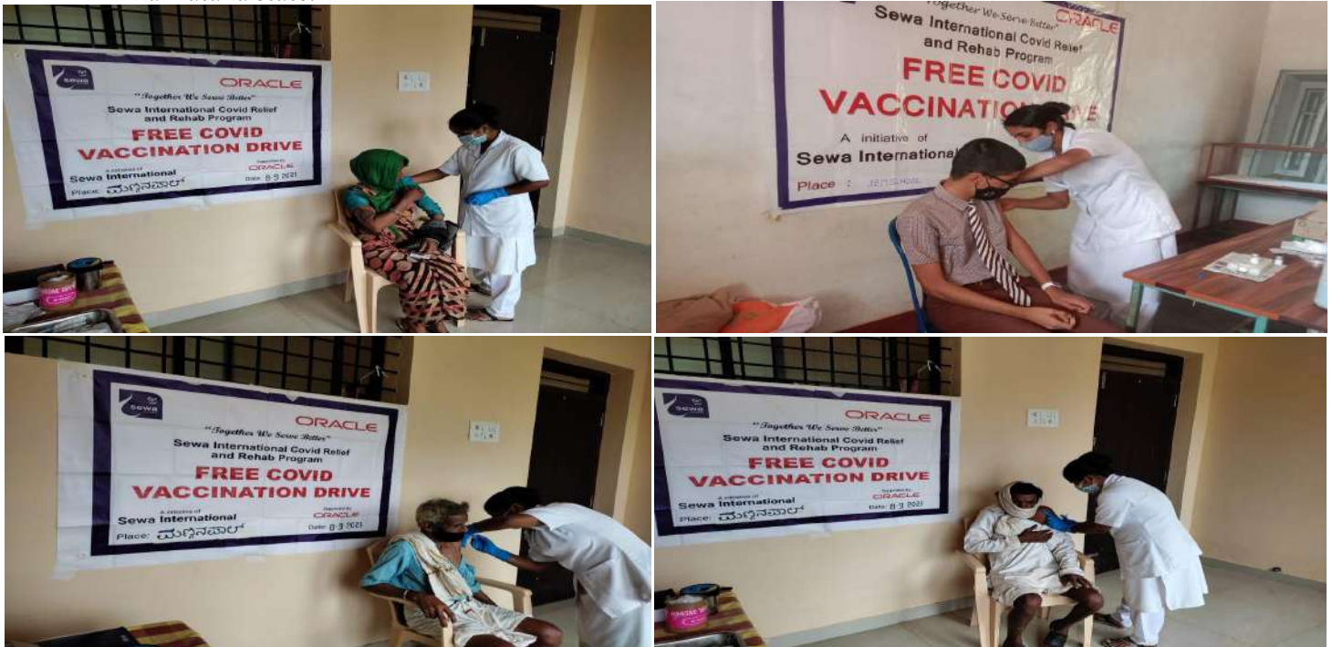
Figure : Free vaccination camps in Karnataka.

We have successfully completed the vaccination drive for 3000 targetted beneficiaries across karnataka state.