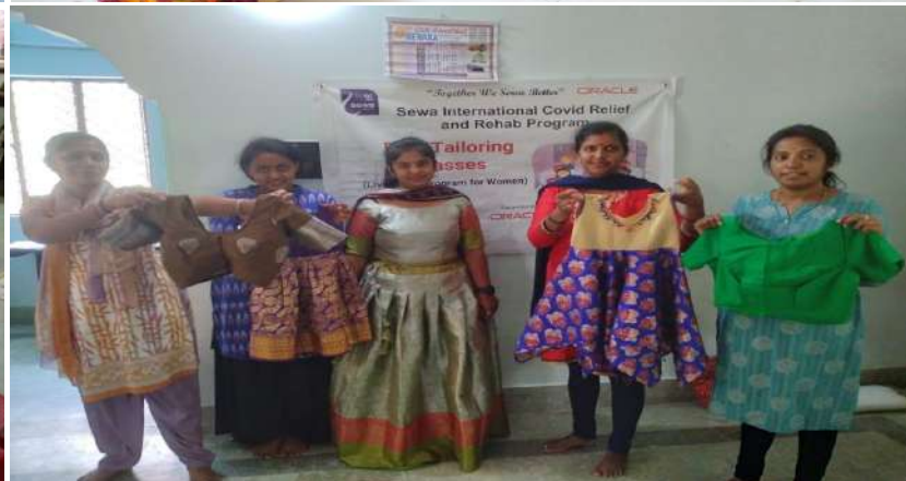
Figure: Tailoring centres in karnataka