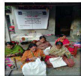
Nakshi kantha Embroidery