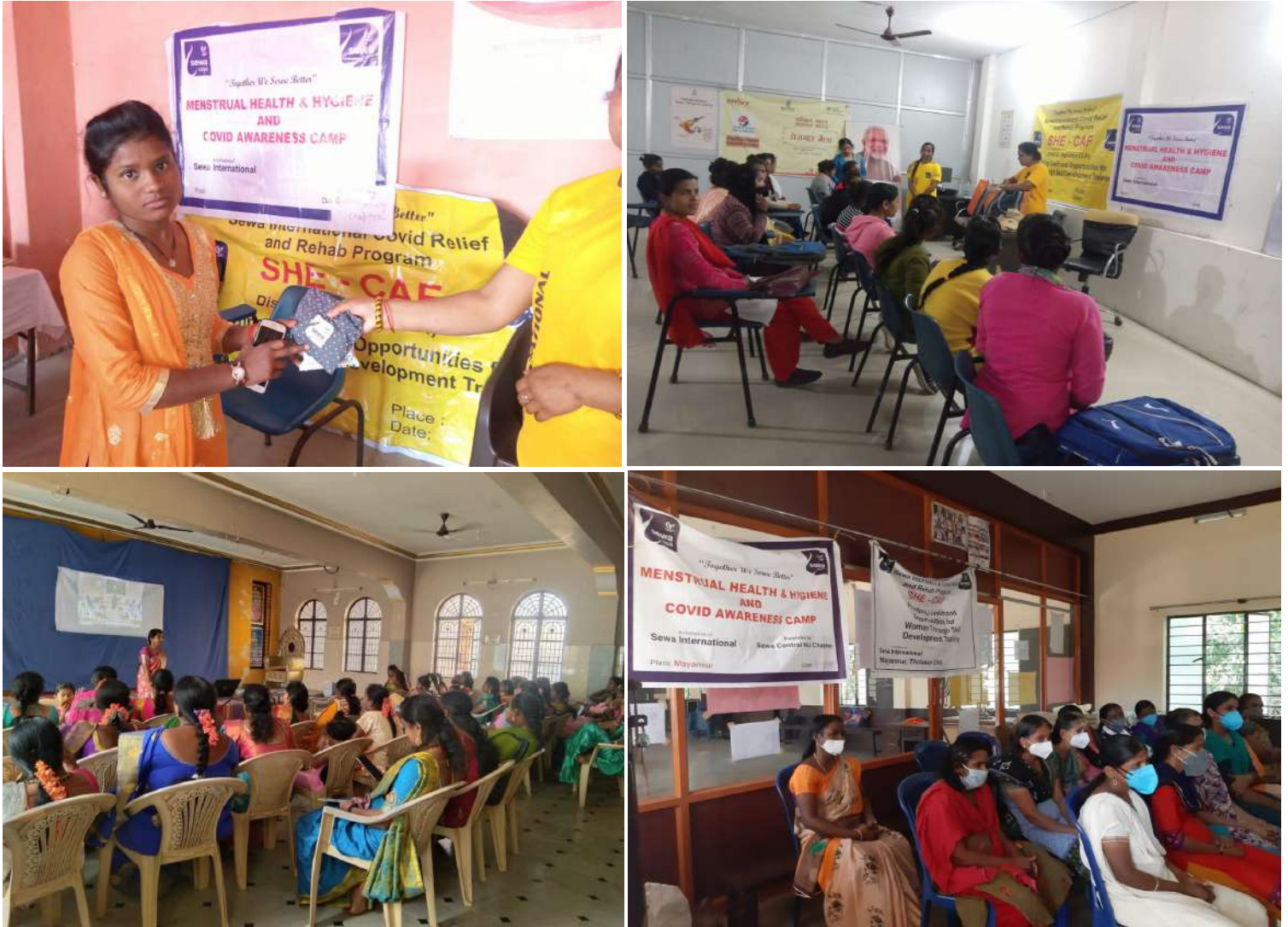
Figure: Menstrual camp for all she-caf beneficiaries.

Under Sewa international's SHE-CAF project, we have reached 1000 women across Bharath.