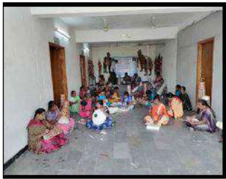
Regional Skill development- leather puppets