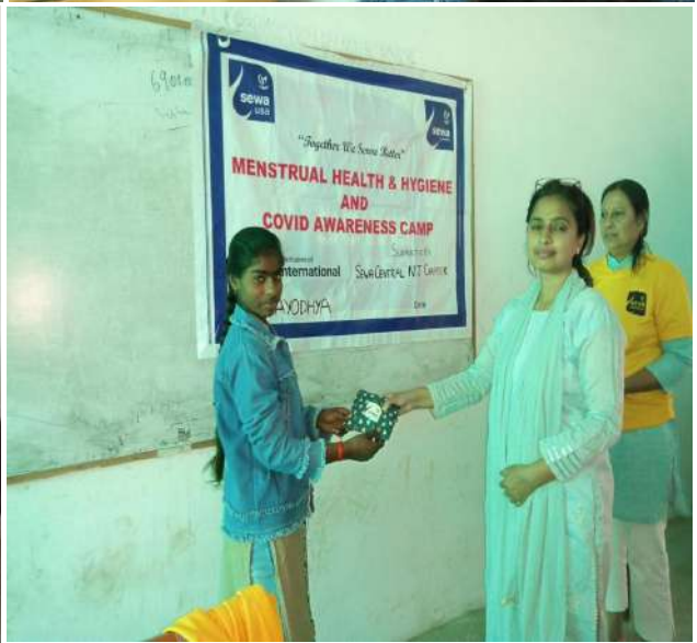
Figure: Menstrual camp for all she-caf beneficiaries.

Menstrual hygiene awareness camps were conducted in Urmila degree college-Shohawal on 11th march 2022 educating 32 students and one camp in Man vaisho mahila degree college-barabanki educating 36 students from vulnerable communities.