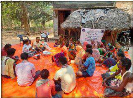
Livestock Rearing – Goat Rearing