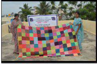
Regional Skill development- Kaudi