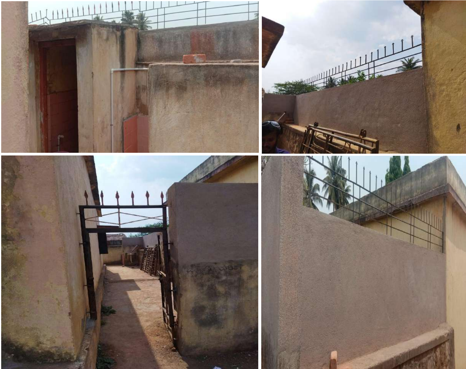
Figure : Toilets Renovation in progress at murgod, belgaum, india.

This school was built during the british ruling period and was used as jail to lock up our freedom fighters, later it was converted into a govt school by the karnataka state government. The toilet blocks built were not in a good condition and sewa is repairing these unit by recreating the sanitary pipelines and the septic tank. We also realised that the blocks were damaged by the localities. To avoid this sewa is constructing new gates and grills, where outsiders cannot use it during the non-school hours.