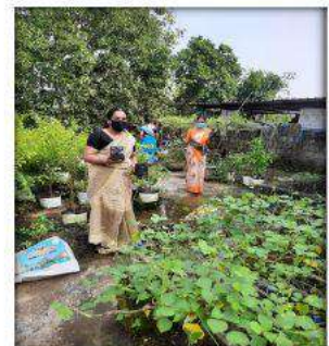
Medicinal Plants Nursery