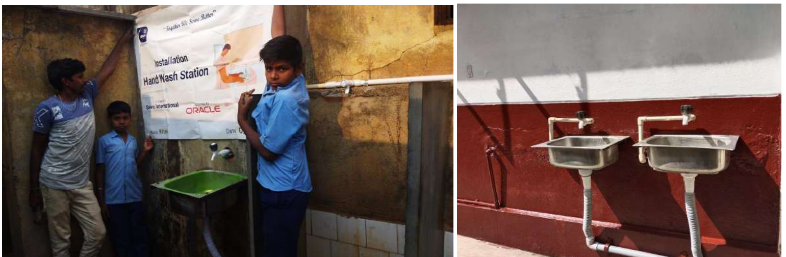
Figure : Free Hand wash station installation in Karnataka

We are installing hand wash units in the government schools,communities. This will help them to wash their hands frequently and stay safe from corona virus.