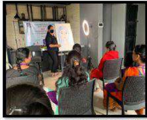
Makeup Artist course