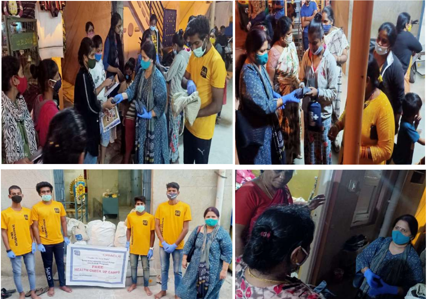
Figure: Free Menstrual awareness camps

We are promoting plastic free re-usable cloth sanitary napkins which are eco-friendly. Through this program we are educating rural & backward community women on menstrual hygiene.