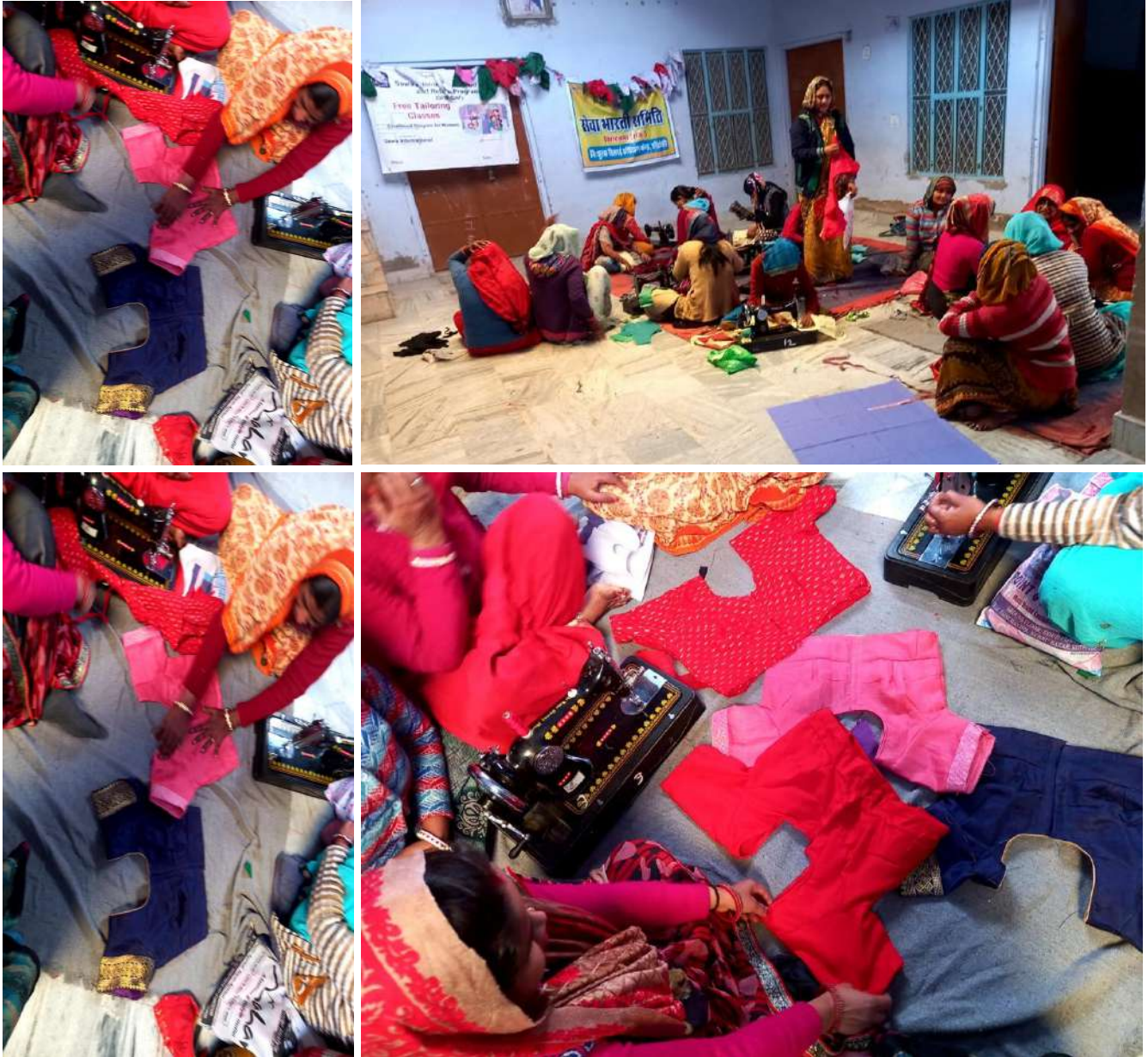
Figure : Free tailoring & embroidery program viratnagar,rajasthan.

This program has been succesfully completed in this month and we will be giving sewing machines after identifying the needy beneficiaries.