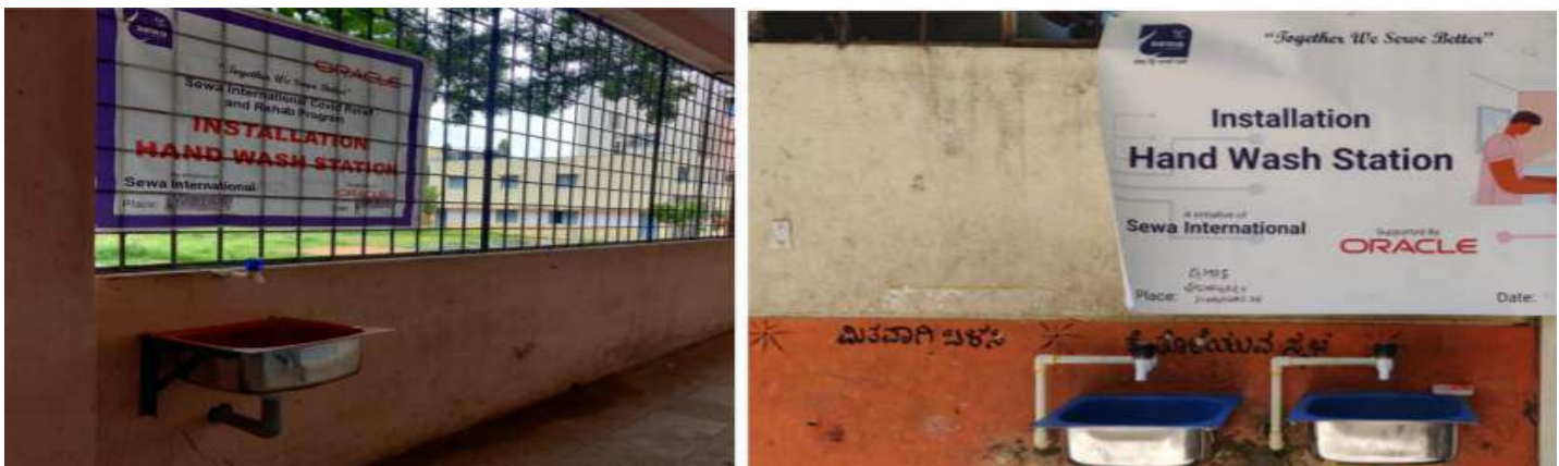
Figure : Free Hand wash station installation in Karnataka

We are installing hand wash units in the government schools,communities. This will help them to wash their hands frequently and stay safe from corona virus.