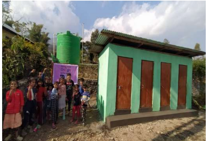
Figure : Toilets construction in northeastern states, india.