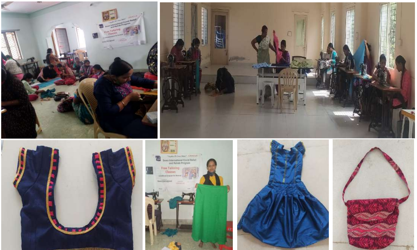
Figure: Tailoring centres in karnataka

We have reached 100+ women across these three centres and they will be trained in basic and advanced tailoring.