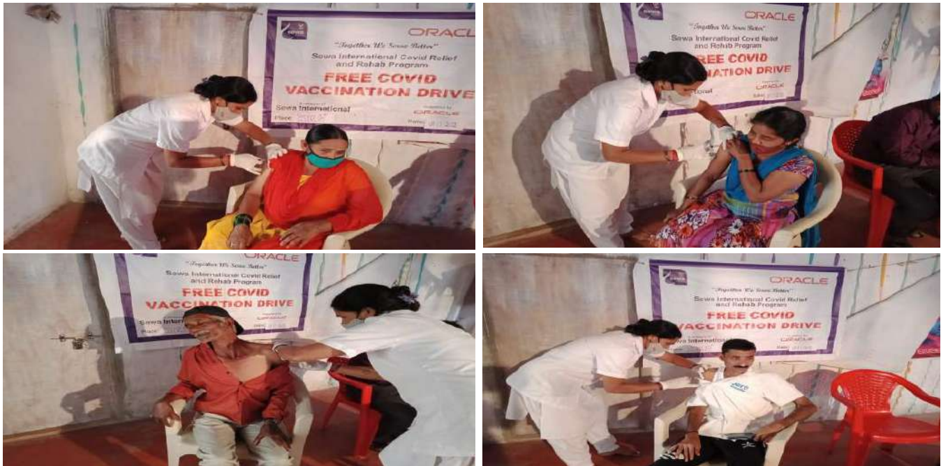
Figure : Free vaccination camps in Karnataka.

We have successfully completed the vaccination drive for 3000 targetted beneficiaries across karnataka state.