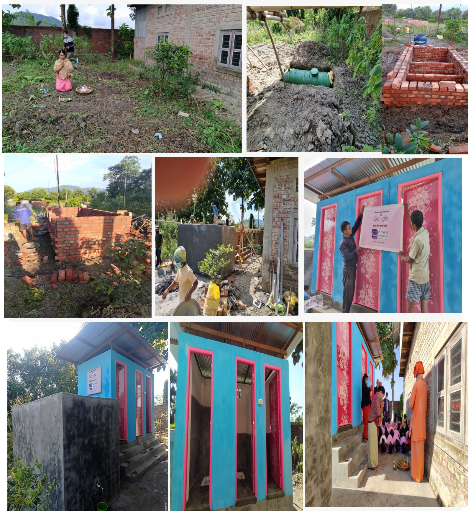
Picture: Completed toilet installation at POIREI children's home Work is in progress at SeloI Junion high school