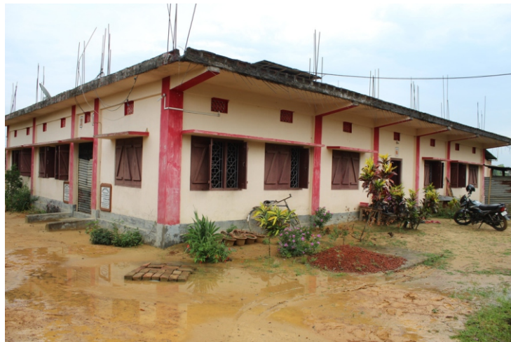
Picture : Sharada devi chatri nivas - Tripura