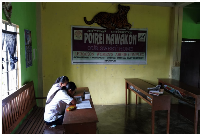
Picture : Porei Childrens home