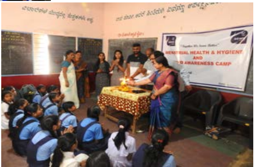
Figure: Menstrual camp done by sewa team

• ಕಲಬುರಗಿ ಜಿಲ್ಲಾ ಆರೋಗ್ಯ ಮತ್ತು ಕುಟುಂಬ ಕಲ್ಯಾಣ ಇಲಾಖೆಯ ಅಧಿಕಾರಿಗಳು ನಗರಗುಂದದಲ್ಲಿ ಬಾಲಕಿಯರಿಗೆ ಮೆಡಿಕಲ್ ಕಿಟ್ ವಿತರಣೆ. ನಗರಗುಂದದಲ್ಲಿ ಬಾಲಕಿಯರಿಗೆ ಮೆಡಿಕಲ್ ಕಿಟ್ ವಿತರಣೆ ಕಾರ್ಯಕ್ರಮವು ನಡೆಯಿತು. ಈ ಕಾರ್ಯಕ್ರಮವನ್ನು ಜಿಲ್ಲಾ ಆರೋಗ್ಯ ಮತ್ತು ಕುಟುಂಬ ಕಲ್ಯಾಣ ಇಲಾಖೆಯ ಅಧಿಕಾರಿಗಳು ನಡೆಸಿದರು. ಈ ಕಾರ್ಯಕ್ರಮದಲ್ಲಿ ಬಾಲಕಿಯರಿಗೆ ಮೆಡಿಕಲ್ ಕಿಟ್ ವಿತರಣೆ ಮಾಡಲಾಯಿತು. ಈ ಕಾರ್ಯಕ್ರಮವು ಬಾಲಕಿಯರ ಆರೋಗ್ಯ ಮತ್ತು ಕುಟುಂಬ ಕಲ್ಯಾಣಕ್ಕೆ ಸಹಾಯ ಮಾಡುತ್ತದೆ.