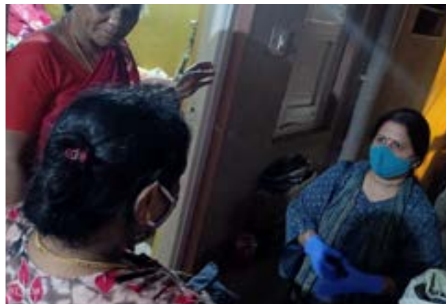
Figure: Free Menstrual awareness camps

We started this program with the target of reaching 3000 beneficiaries over a period of one year. We have successfully achieved this target in this month by conducting door to door awareness campaigns, considering the covid situation in karnataka.