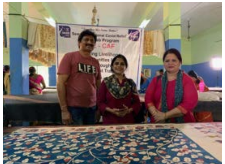
Figure: SHE-CAF project visits by sewa team