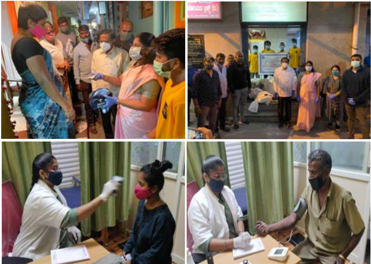
Figure: Free Health checkup camps

We do basic health check up, Blood pressure test, sugar test, eye and dental checks for the beneficiaries and also distribute free immunity boosters and multivitamins to them.