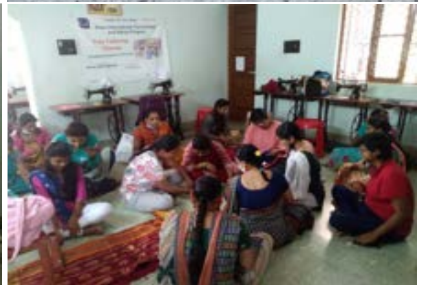
Figure: Tailoring centres in Karnataka