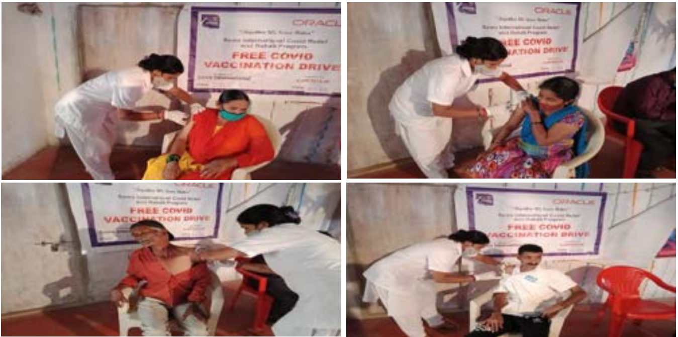
Figure : Free vaccination camps in Karnataka.

We have successfully completed the vaccination drive for 3000 targetted beneficiaries across karnataka state.