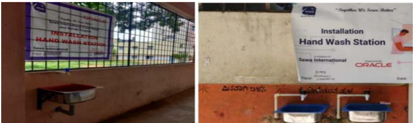
Figure : Free Hand wash station installation in Karnataka

We are installing hand wash units in the government schools,communities. This will help them to wash their hands frequently and stay safe from corona virus.