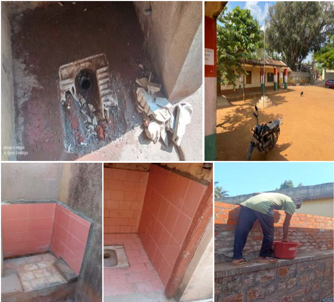
Figure : Toilets Renovation at murgod,belgaum,india.

This school was built during the british ruling period and was used as jail to lock up our freedom fighters,later it was converted into a govt school by the karnataka state government.The toilet blocks built were not in a good condition and sewa is repairing these unit by recreating the sanitary pipelines and the septic tank. We also realised that the blocks were damaged by the localities.To avoid this sewa is constructing new gates and grills,where outsiders cannot use it during the non-school hours.