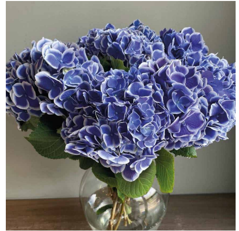
SILVER LINING PLAYBOOK

Roses, Sunflowers, Statice, Lisianthus, Button Chrysanthemum and dries— a breathtaking melange of colours, textures and shapes.