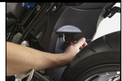
9 Using 5mm Allen Wrench, tighten the M6 Screw. You can adjust clearance between tire and swingarm with the screw, if needed. DO NOT OVERTIGHTEN.