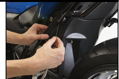
6 Install zip ties upward from the bottom through the slots, and around the frame.

WARNING AND DISCLAIMER: All parts manufactured, designed or sold by Machineart Moto ("MaMo") should be installed by a qualified motorcycle technician. The risk of injury is increased by improper installation or misuse of equipment. MaMo's customers must exercise good judgment in the use, control, alteration, part selection and installation, and maintenance of their motorcycles. In the event of a possible defect in material or design, or any other defect in a part manufactured, designed or sold by MaMo, the responsibility of MaMo is limited to a refund of the purchase price or the replacement of the part if MaMo determines the part to be defective, and subject to MaMo's inspection of the part within thirty (30) days from the date of purchase. (Note: any attempted repairs or modifications made to MaMo products will void this limited warranty). MaMo, under no circumstances will be responsible for incidental and/or consequential damages, property damage, personal injury damage, or damage, injury, cost or expense of any kind or nature whatsoever except as provided by law. MaMo makes no other warranty, express or implied, including without limitation any warranties of merchantability and fitness for a particular purpose.