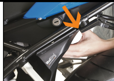
4 Place MudSling above rear tire and under the existing fender. Locate the MudSling wings against the registration point (welded feature on frame).

Clean with soap and water. Use Armor-All to restore appearance.