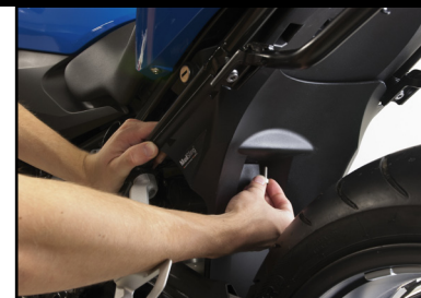
5 Apply a small amount of Loctite 248 to the M6 Screw. Hold the MudSling in position and thread screw into the Coupling Nut finger-tight.