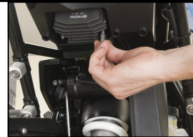
2 Apply a small amount of Loctite 248 to threaded stud. Install Coupling Hex Nut. Secure with a 10mm Open-End Wrench. DO NOT OVERTIGHTEN