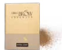
EXTRA LIGHT OMC016-EL

POSITION 3: Should line up from the end of the nose passing diagonally towards the end of the eye and finish at a fine point