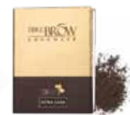
EXTRA DARK OMC016-ED

HOW DO I REMOVE THE FIBRE BROW & CLEAR BROW FIXING GEL? To remove simply use water. Upon removal, no traces of the product will be visible