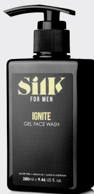
IGNITE CODE - SM4051 WEIGHT - 0.36

PENTAVITIN® and ALPAFLOR® ALP®-SEBUM are trademarks of DSM