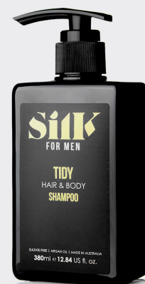
TIDY CODE - SM4011 WEIGHT - 0.46