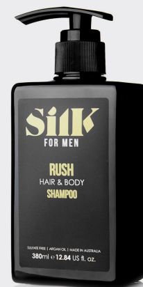
RUSH CODE - SM4013 WEIGHT - 0.46