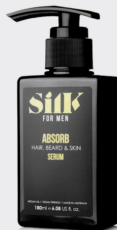
ABSORB CODE - SM4050 WEIGHT - 0.24