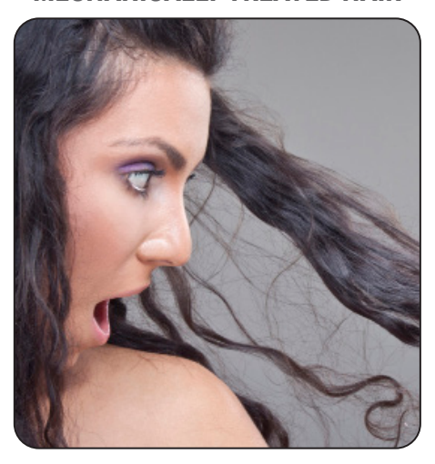
OVER PROCESSED MECHANICALLY TREATED HAIR