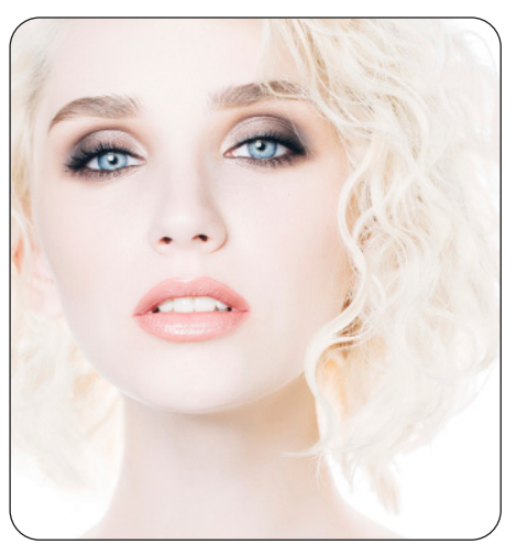
CHEMICALLY COMPROMISED HAIR