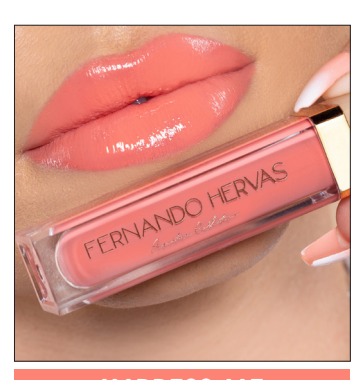
IMPRESS ME - SILKFONIM