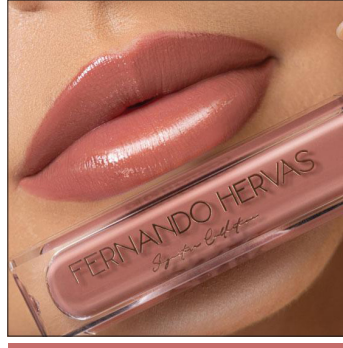
NUDE 6 DEEP ROSY NUDE - SILKFCN6LG