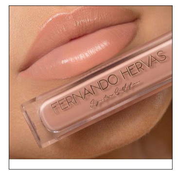
NUDE 3 PEACHY BEIGE NUDE - SILKFCN3LG