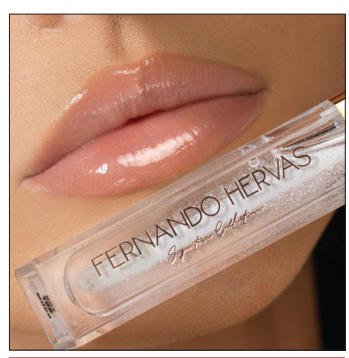
NOT TOO MUCH