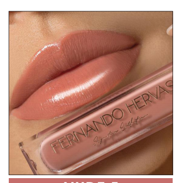
NUDE 5 MID TONE ROSY NUDE - SILKFCN5LG