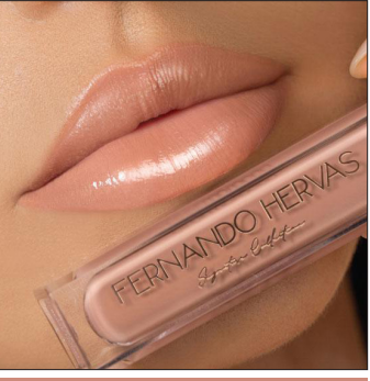
NUDE 2 WARM PEACH NUDE - SILKFCN2LG