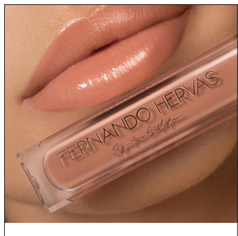
NUDE 4 MID TONE NUDE - SILKFCN4LG