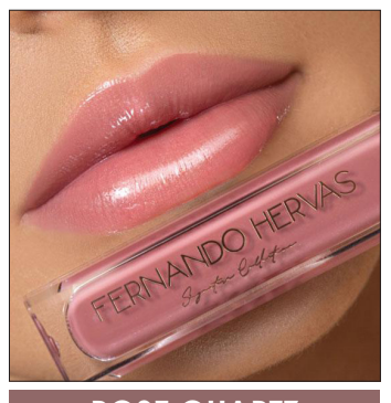
ROSE QUARTZ - SILKFCNRQLG