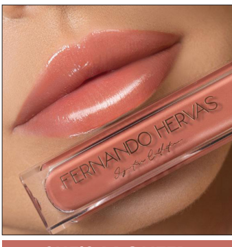
SHE'S BRONZED - SILKFCNSBLG