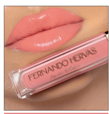
SHE'S SO PEACHY - SILKFCNSSP