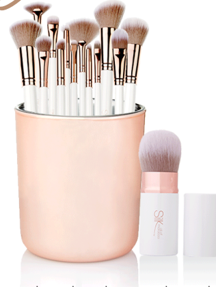
ALL BRUSHES USED FROM THE 'VEGAN ROSE GOLD & WHITE' BRUSH SET

STEP 1: Starting with a freshly cleaned face, apply the Argan Antioxidant Primer all over the face with your fingers, massaging it into the skin. For more glow, add a couple of drops of the Total Radiance Bronzing Liquid into your primer.