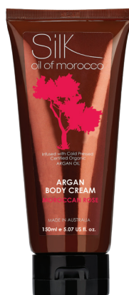
OMBCMR HS Code- 3304.99.00

PENTAVITIN® - Pentavitin is a Natural Active Ingredient and is used in very high-end Skin care facial products we believe your Body is just as important as your face! expect moisture, hydration locked in for 72 hours your skin will feel extremely soft and smooth.