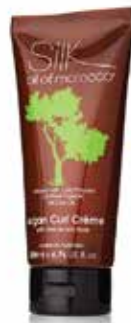
200ML - OM2046-200 HS-3305.90.00 0.22 kg 17.9cm high x 5cm in cap diameter 7.8cm wide at top of tube

WARNING: Avoid getting into the eyes. If product gets into eyes wash out thoroughly with water.