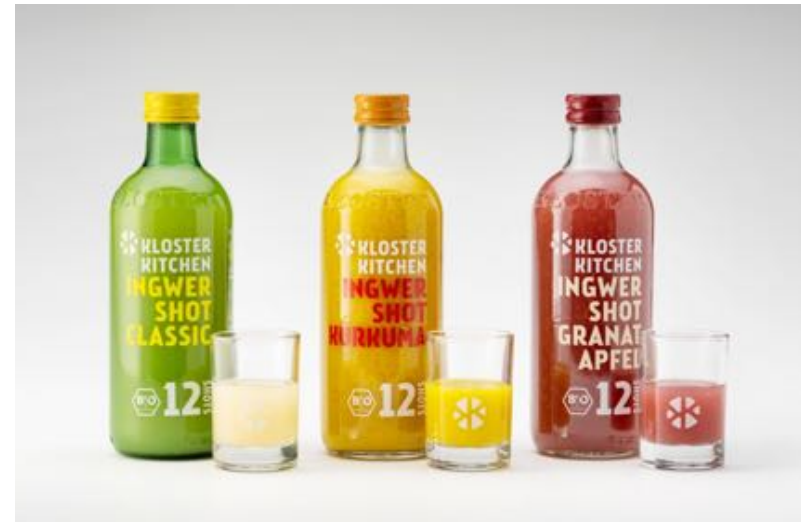
12SHOTS 360ml - 12 portions