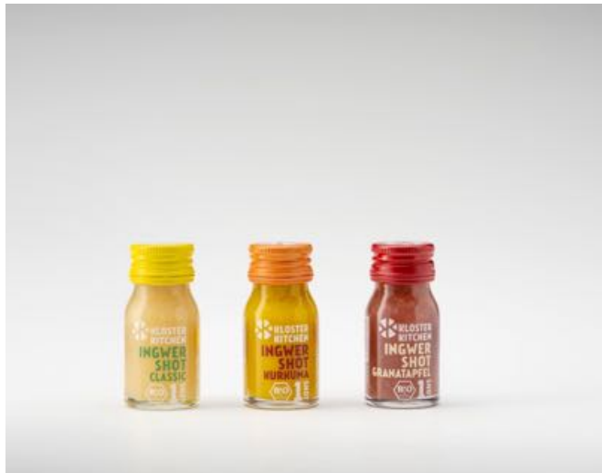
1SHOT 30ml - 1 portion TO-GO