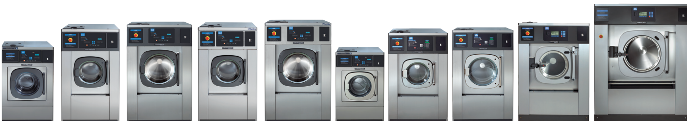
M-Series Hard-Mount Washer-Extractors

GREEN FOCUSED Offering green-engrained features that conserve water, energy and natural gas, Continental Girbau Washer-Extractors offer advanced technologies and deliver superior wash quality using considerably less water. A sump-less design, exclusive AquaFall™ System and a programmable control combine to slash water usage and ensure excellent wash quality. Less water used equates to less water heated and additional savings in utilities. The washers can also be combined with a water reclamation and ozone system for additional water savings. No wonder Continental laundry products qualify for Leadership in Energy and Environmental Design (LEED) credits, which can contribute to LEED certification!