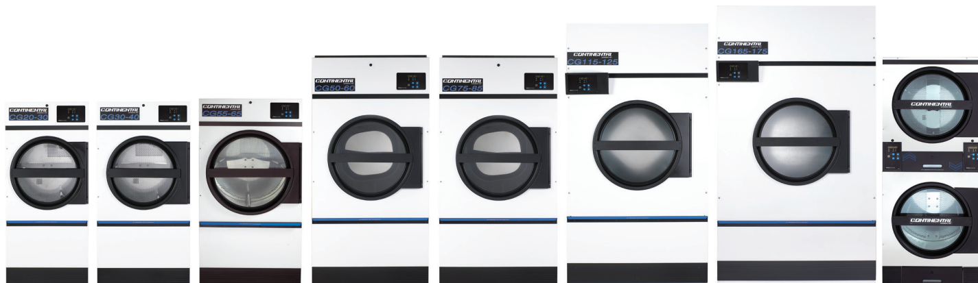
Pro-Series II Drying Tumblers

An economic, compact and productive folder, it quickly and accurately folds small- and large-scale items including hand towels and full size bath towels. Items are manually fed onto a feeding table for rapid and accurate folding and stacking. The FT-LITE folder automatically stacks items according to established program settings. The control offers an easy-to-use touch-screen display that delivers total control over the folding and stacking of multiple items. Each of the programmed items can be folded according to a variety of specifications, including primary- and secondary-fold options.