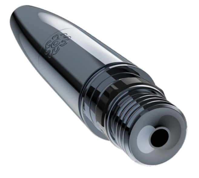
Body isometric view

Caution: Do not introduce any types of liquid inside the system or autoclave.