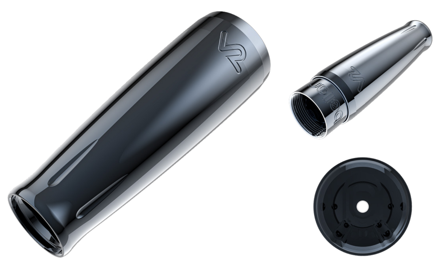
Autoclavable Ergonomic Grip design