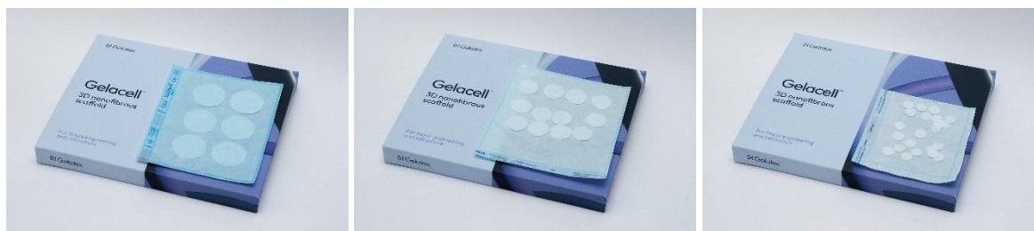
Figure 1: Gelacell™ inserts in different sizes for 6/12/24 well plates.

Gelacell™ is a unique, 3D microfibrous scaffold specifically engineered for advanced in vitro 3D cell culture and tissue engineering applications. Designed as a non-woven, highly porous scaffold, Gelacell™ offers exceptional biocompatibility and non-toxicity across a variety of cell types. Our specially designed scaffold “inserts” offer cell culture conditions for short-to-medium durations. Perfectly tailored for the cultivation of complex systems like cell microenvironments, tissue regeneration, and organoids, Gelacell™ also makes a robust platform for drug screening and other cell culture investigations. The optimized design of the scaffold ensures thermal, chemical, and mechanical stability, while also providing substantial swelling capabilities and porosity, allowing efficient nutrient diffusion and thereby preventing cellular waste build up.