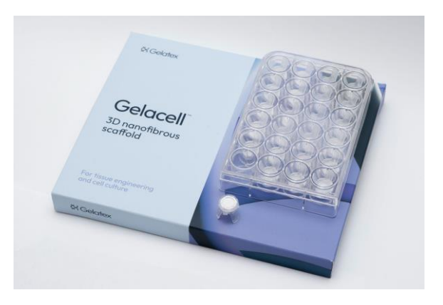
Figure 1: Gelacell<sup>™</sup> scaffolds fixed in a cell crown in 24 well plates.

Gelacell<sup>TM</sup> is a unique, 3D microfibrous scaffold specifically engineered for advanced in vitro 3D cell culture and tissue engineering applications. Designed as a non-woven, highly porous scaffold, Gelacell<sup>TM</sup> offers exceptional biocompatibility and non-toxicity across a variety of cell types. This variant of Gelacell<sup>TM</sup> is specially designed for medium-to-long term cell culture durations. The scaffolds are fixed in a cell crown that act as a Boyden chamber for facilitating studies related to air-liquid interface culture, co-culture, complex tissue models, etc. Gelacell<sup>TM</sup> also makes a robust platform for drug screening and other cell culture investigations. The optimized design of the scaffold ensures thermal, chemical, and mechanical stability, while also providing substantial swelling capabilities and porosity, allowing efficient nutrient diffusion and thereby preventing cellular waste build up.