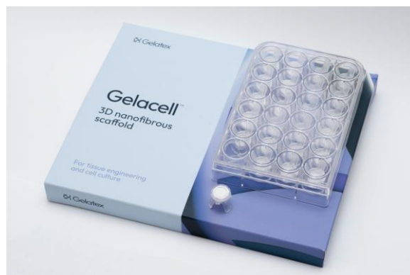
Figure 1: Gelacell™ scaffolds fixed in a cell crown in 24 well plates.

Gelacell™ is a unique, 3D microfibrous scaffold specifically engineered for advanced in vitro 3D cell culture and tissue engineering applications. Designed as a non-woven, highly porous scaffold, Gelacell™ offers exceptional biocompatibility and non-toxicity across a variety of cell types. This variant of Gelacell™ is specially designed for medium-to-long term cell culture durations. The scaffolds are fixed in a cell crown that act as a Boyden chamber for facilitating studies related to air-liquid interface culture, co-culture, complex tissue models, etc. Gelacell™ also makes a robust platform for drug screening and other cell culture investigations. The optimized design of the scaffold ensures thermal, chemical, and mechanical stability, while also providing substantial swelling capabilities and porosity, allowing efficient nutrient diffusion and thereby preventing cellular waste build up.