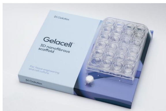
Figure 1: Gelacell™ scaffolds fixed in a cell crown in 24 well plates.

Gelacell™ is a unique, 3D microfibrous scaffold specifically engineered for advanced in vitro 3D cell culture and tissue engineering applications. Designed as a non-woven, highly porous scaffold, Gelacell™ offers exceptional biocompatibility and non-toxicity across a variety of cell types. This variant of Gelacell™ is specially designed for medium-to-long term cell culture durations. The scaffolds are fixed in a cell crown that act as a Boyden chamber for facilitating studies related to air-liquid interface culture, co-culture, complex tissue models, etc. Gelacell™ also makes a robust platform for drug screening and other cell culture investigations. The optimized design of the scaffold ensures thermal, chemical, and mechanical stability, while also providing substantial swelling capabilities and porosity, allowing efficient nutrient diffusion and thereby preventing cellular waste build up.