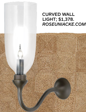
CURVED WALL LIGHT; $1,378. ROSEUNIACKE.COM