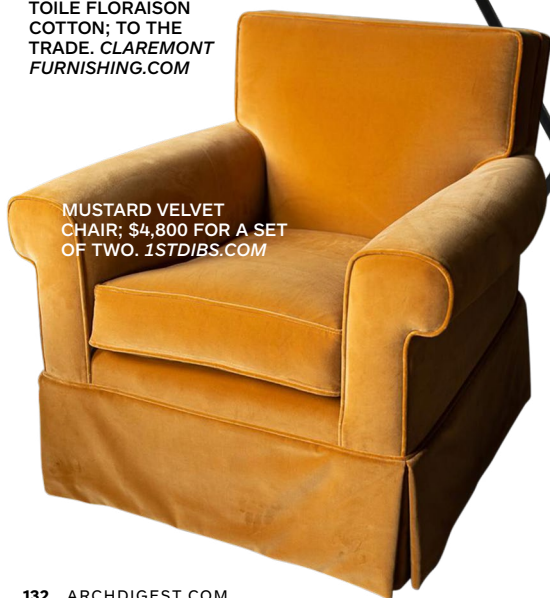
MUSTARD VELVET CHAIR; $4,800 FOR A SET OF TWO.