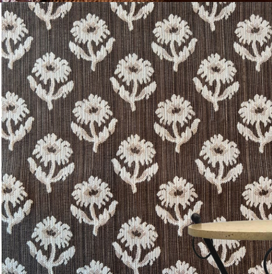
TOILE FLORAISON COTTON; TO THE TRADE. CLAREMONT FURNISHING.COM