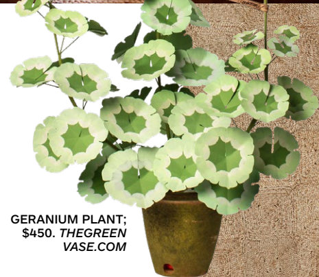
GERANIUM PLANT; $450. THEGREENVASE.COM