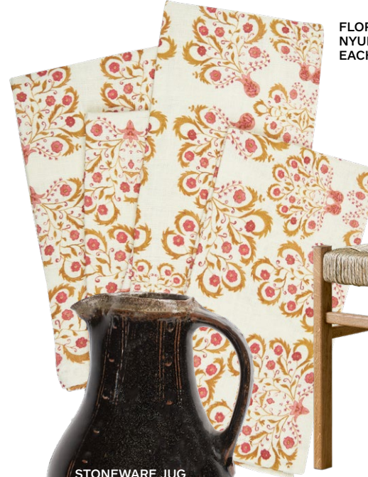
STONEWARE JUG BY JIM MALONE; $1,109. 8HOLLANDSTREET.COM