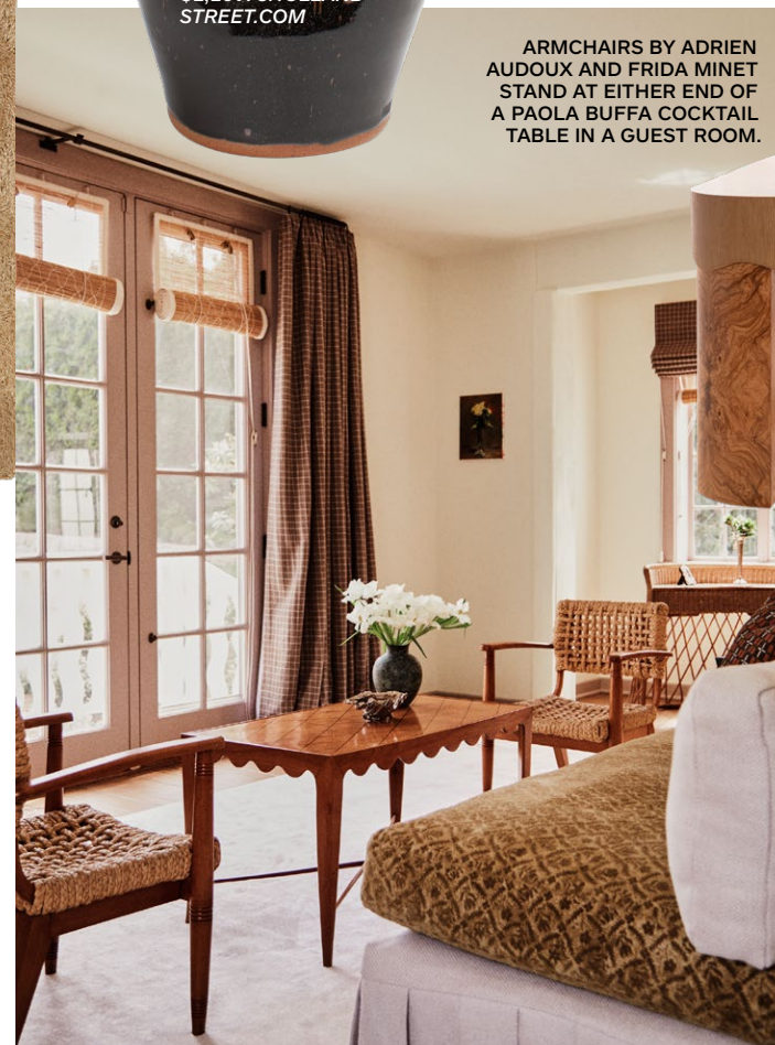
ARMCHAIRS BY ADRIEN AUDOUX AND FRIDA MINET STAND AT EITHER END OF A PAOLA BUFFA COCKTAIL TABLE IN A GUEST ROOM.

INTERIORS: BILLAL TARIQHT. COFFEE TABLE: KATE BERRY. ALL OTHER PRODUCTS COURTESY OF THE COMPANIES.