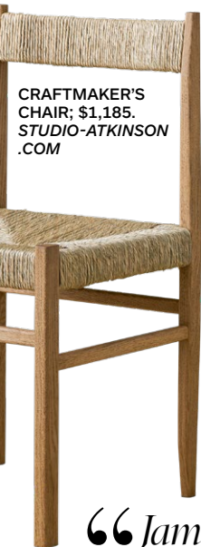
CRAFTMAKER'S CHAIR; $1,185. STUDIO-ATKINSON.COM