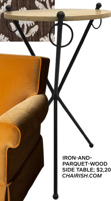
IRON-AND-PARQUET-WOOD SIDE TABLE; $2,200. CHAIRISH.COM