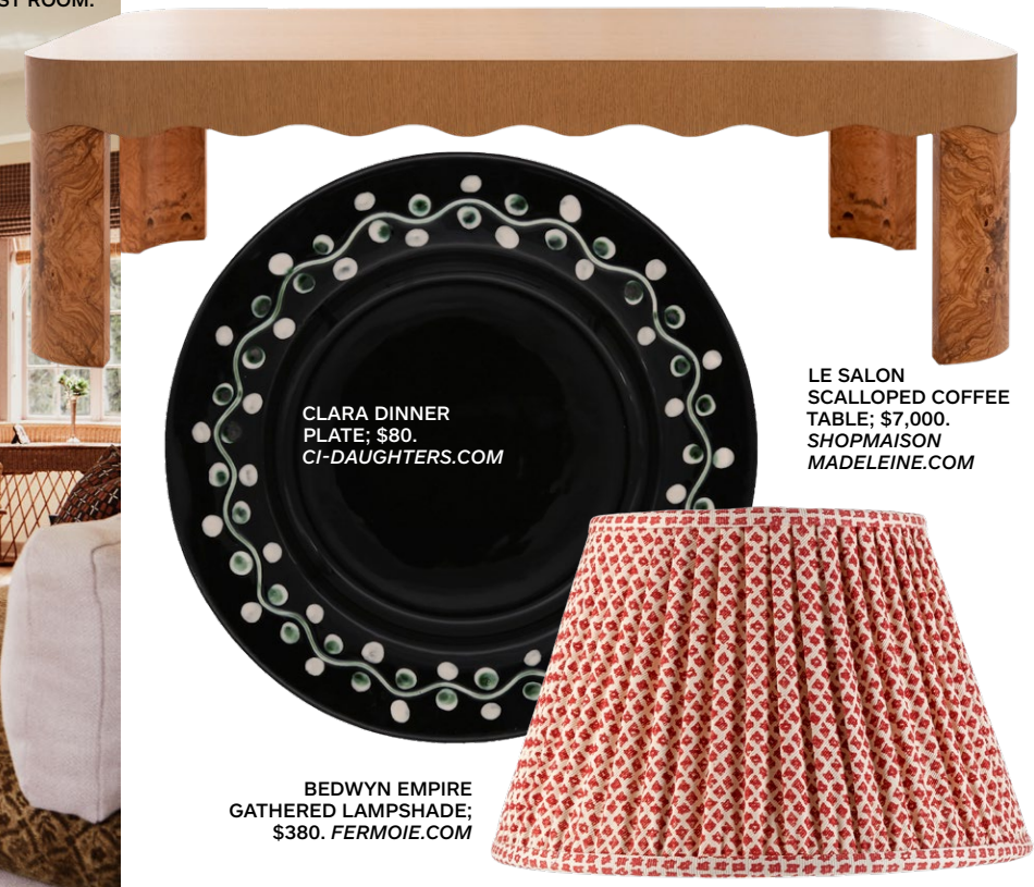
CLARA DINNER PLATE; $80. CI-DAUGHTERS.COM

“Jamie wanted every room to be special. She was like: Let's go for it! If we're going to do it, we're going to do it right.” —Mike Moser