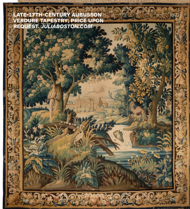
LATE-17TH-CENTURY AUBUSSON VERDURE TAPESTRY; PRICE UPON REQUEST. JULIABOSTON.COM

INTERIORS: BILLAL TARIQHT. COFFEE TABLE: KATE BERRY. ALL OTHER PRODUCTS COURTESY OF THE COMPANIES.