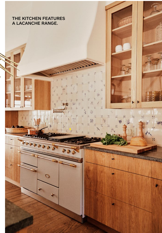
THE KITCHEN FEATURES A LACANCHE RANGE.