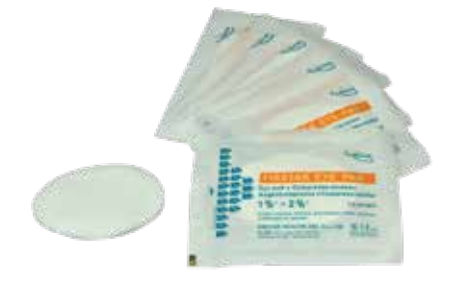
EYE PAD Sterile gauze eye pad. Single use. Dimension: 5cm x 7.5cm.