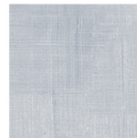
780HP-04 Paris Blue