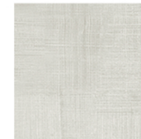
780HP-03 Dove Grey