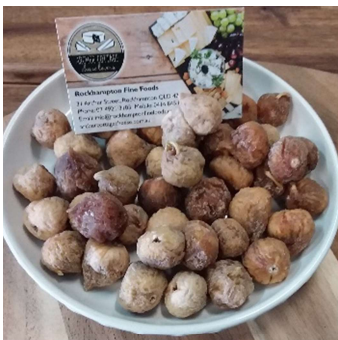
Semi-Dried Wild Figs