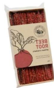
Beetroot Artisan Flatbread