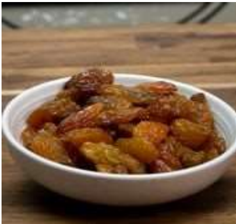
Golden Jumbo raisins