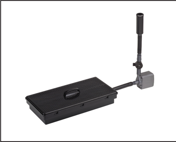
PONDMASTER FILTER WITH ADJUSTABLE FOUNTAIN ATTACHED TO PUMP*